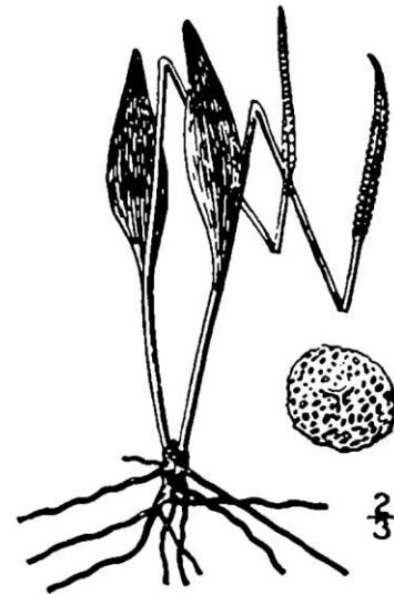
Drawing: USDA-NRCS PLANTS Database / Britton, N.L., and A. Brown. 1913. An illustrated flora of the northern United States, Canada and the British Possessions . 3 vols. Charles Scribner's Sons, New York. Vol. 1: 2.

A Species of Greatest Conservation Need in the Massachusetts State Wildlife Action Plan