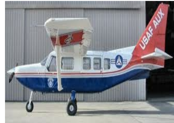
Civil Air Patrol is an auxiliary unit of the Air Force