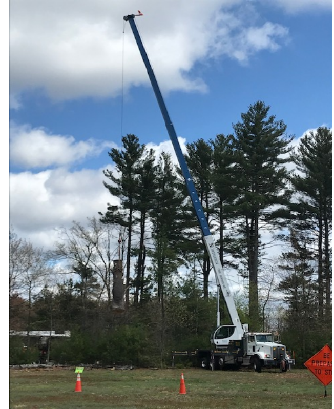
White Pine Tree Removal Crane