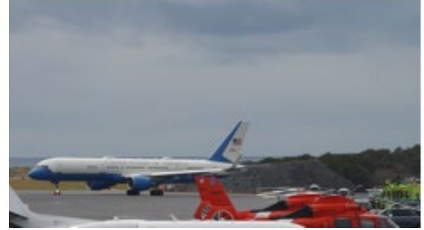
Air Force One taxiing into the airport