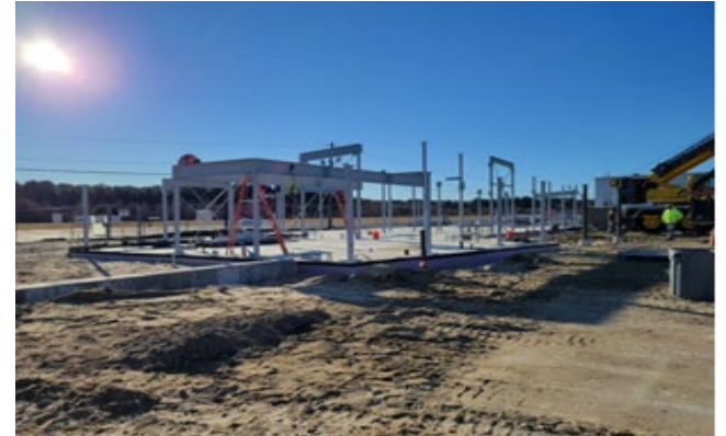
Internal steel of the new administration building