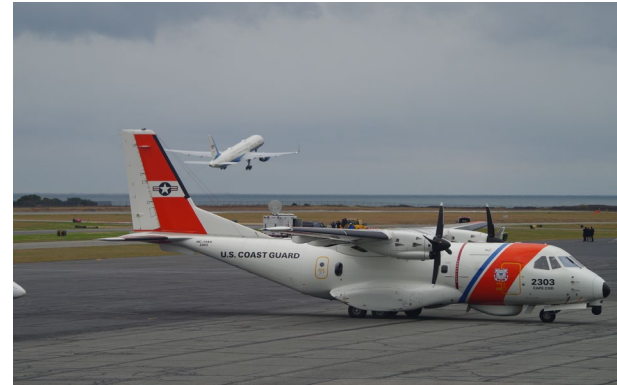
Air Force One taking off in the background with US Coast Guard Aircraft in foreground