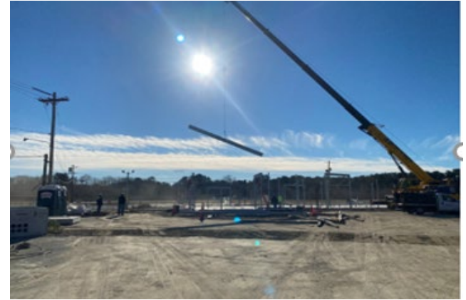
A crane transports a horizontal beam into place