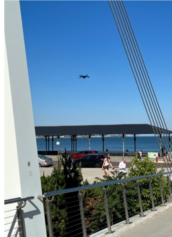
Drone demonstration for bridge inspection of pedestrian bridge