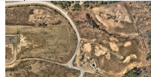
Completed Obstruction Removal on RW 20 End