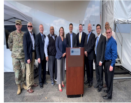
Speakers address their support for Counter UAS