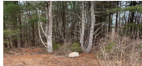
Vegetative Obstructions off Runway 2-20