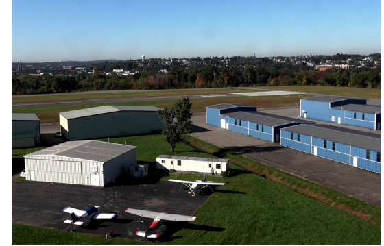
Camera View of Runway 14 End and Hangers