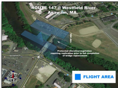
D2 Agawam Bridge Aerial Imagery