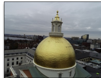
Statehouse Dome Structure Assessment