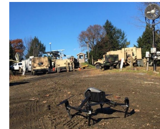
FEMA/MEMA Emergency Service