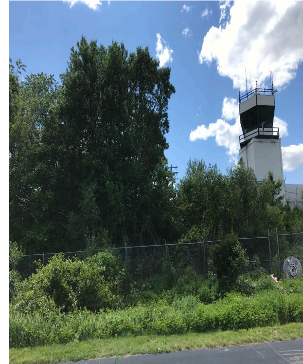
Trees obstructing view of Runway 35