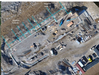
D3 HQ Construction Monitoring