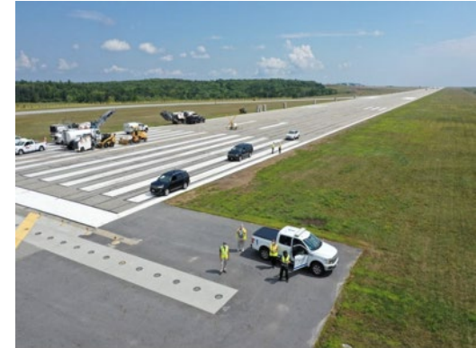
Worcester Airport Runway 11 Approach