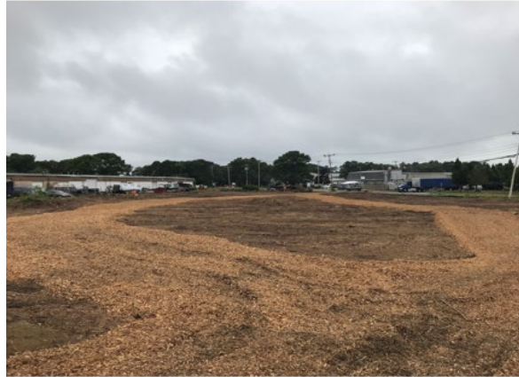
Cape Cod Commission Walkway Mitigation Project