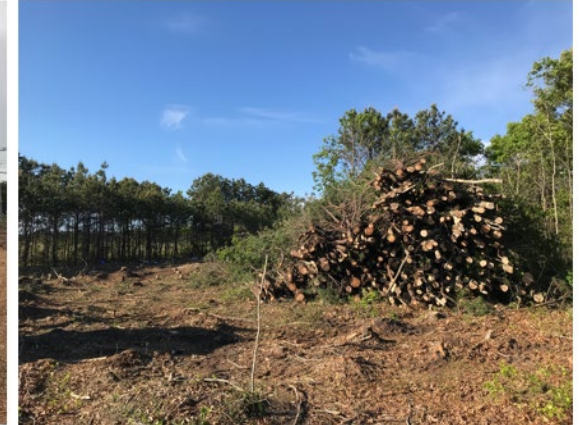
Tree Obstructions - Runway 15 Approach