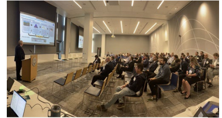
AUVSI Conference in Burlington, MA