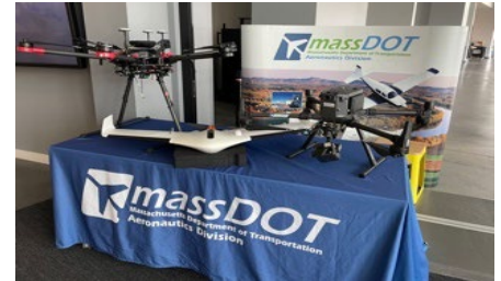
MassDOT Drone Display