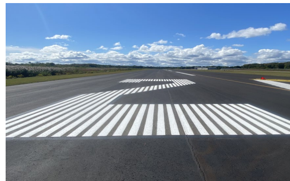
Marshfield Municipal Airport – George Harlow Field Runway Numeral Markings (2022 Statewide Pavement Maintenance Project)