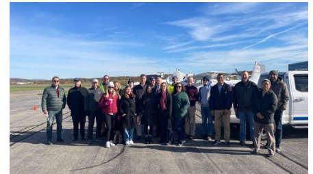
Drone Demo at Lawrence Municipal Airport