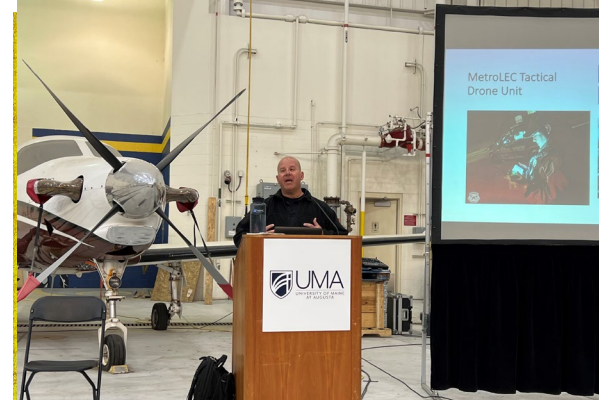
MassDOT Drone Team Shares Various Drone Use Cases