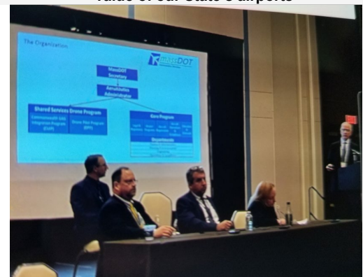
MassDOT staff provides updates on key airport programs and division initiatives