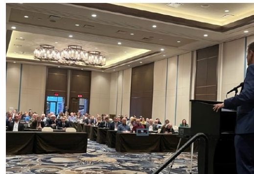
Senator Velis addresses the conference delegation on airport industry issues and the value of our State's airports