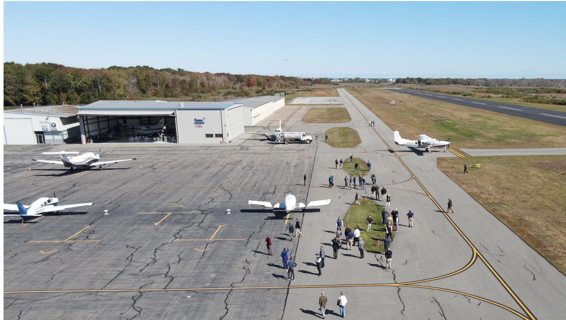
Deteriorating pavement prior to reconstruction

Significantly improving the level of safety and addressing critical environmental concerns