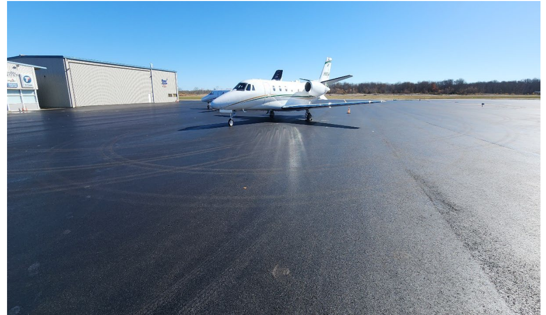
Post apron reconstruction

$5.2M project, including MassDOT, FAA and local funding.