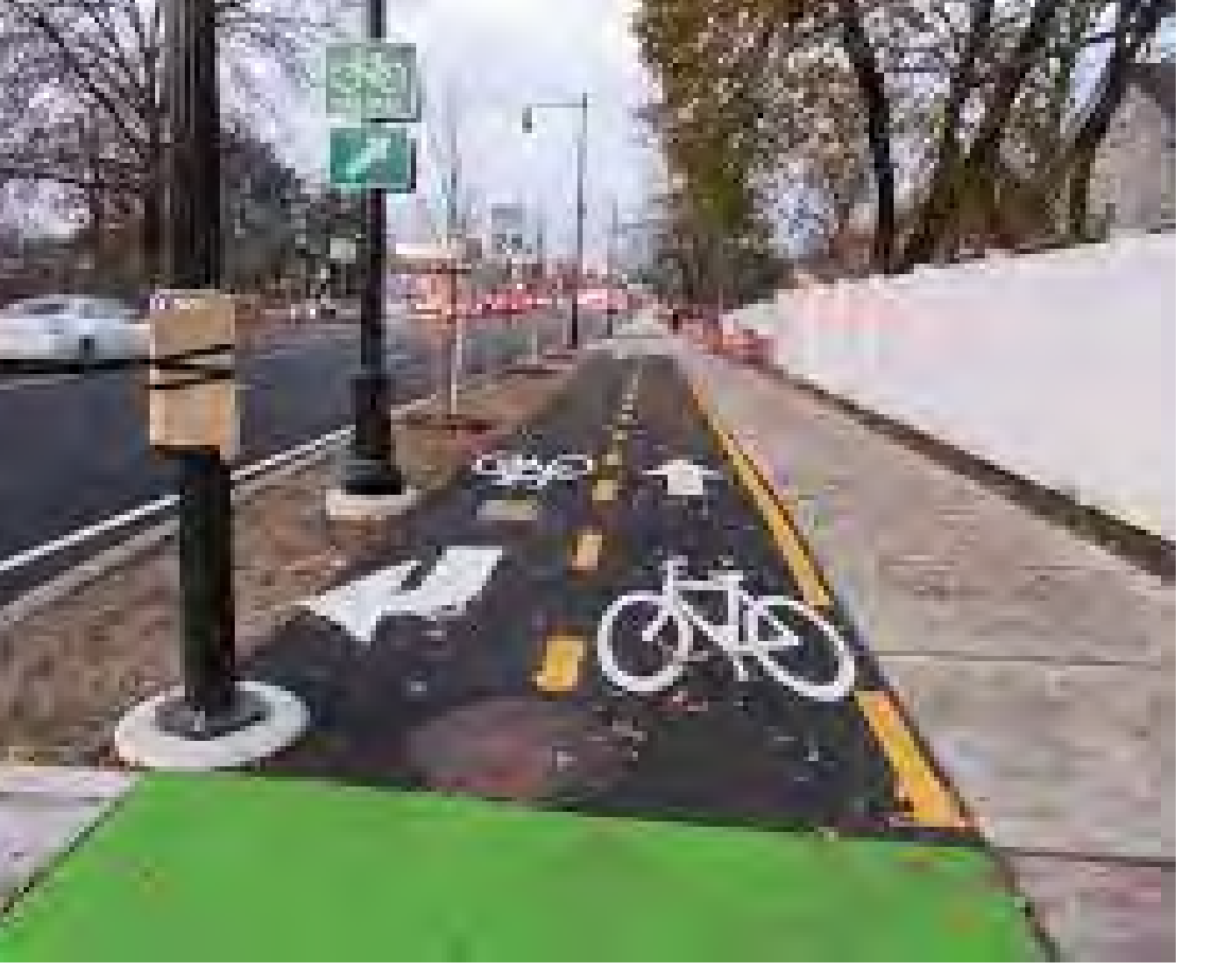
NEW SIDEWALKS, RE-ROUTE PAUL DUDLEY WHITE PATH