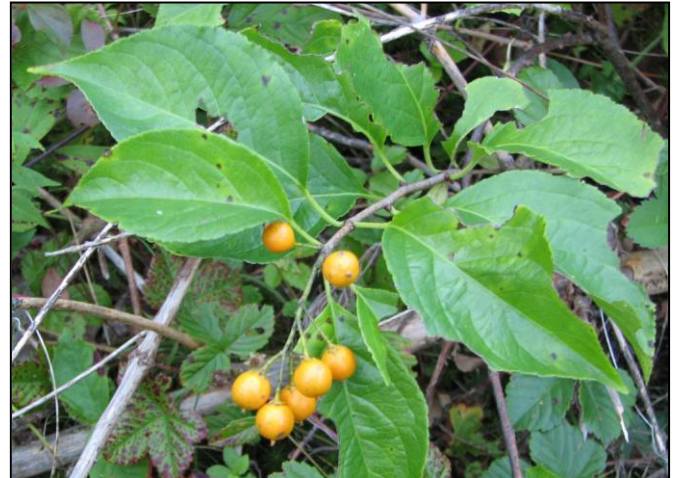
American Bittersweet has elliptical or ovate leaves and terminal clusters of orange-yellow fruit capsules.

AIDS TO IDENTIFICATION: The leaves of American Bittersweet are alternate, elliptical or ovate (5–8 cm long; 3–5 cm wide), yellowish-green, and pointed with serrate margins. The brown bark is initially smooth and turns corky and scaly as it matures. The inconspicuous, cup-shaped flowers are 2 to 3 mm tall, greenish-yellow, and have five sepals. They appear in terminal clusters that are 3 to 8 cm long, typically with 6 or more flowers per inflorescence. Spherical orange-yellow fruit capsules split open in the fall to reveal the waxy, red, fleshy arils that surround the seeds. The showy fruits and arils may persist through the winter.