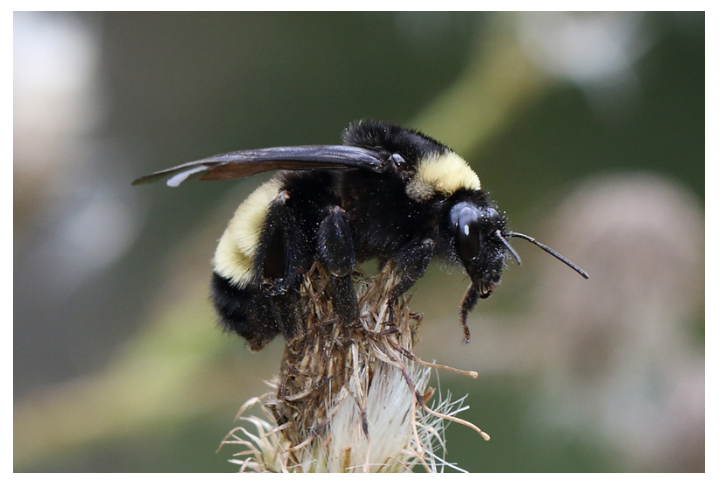
Bombus pensylvanicus, female • VA: Wythe Co., Ivanhoe • 20 Sep 2017