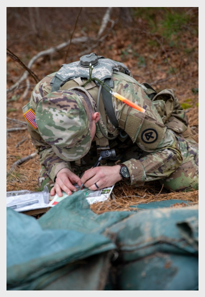
A Massachusetts National Guard Soldier competes in the day to night land navigation event during the 2024 Best Warrior Competition at Camp Edwards.

Camp Edwards has four operational active small arms ranges: Echo (Combat Pistol/Military Police Qualification Course, 15 firing lanes), India (25-meter with 20 firing positions), Tango (25-meter with 32 firing positions), and Sierra (automated 300-meter pop-up modified record of fire range). Lima Range is a 40mm practice grenade range using the M781 40mm Training Round.