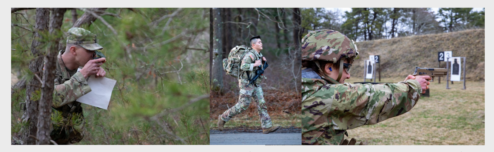
Massachusetts National Guard Soldiers compete in various elements of the 2024 Best Warrior Competition at Camp Edwards. From left, a Soldier competes in the day to night land navigation event; the 12-mile ruck event, and the pistol match event at Echo Range.

During TY 2024, bids were received to build a Multi-Purpose Machine Gun Range. Several bids were received, however, at the end of the Federal Fiscal Year in September 2024, no contract was in place and without a construction contract in place, the military construction funding previously authorized for the range was lost.