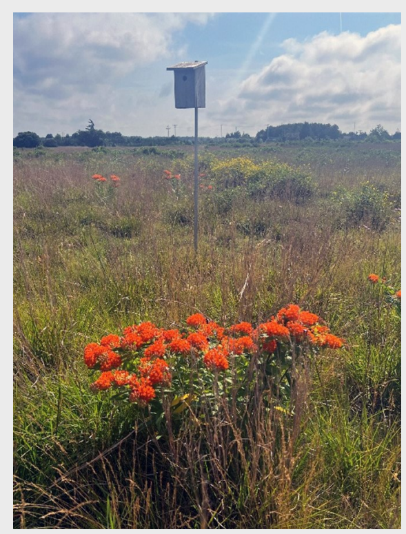
Butterfly Milkweed and Wild Indigo are well intermixed with Little Bluestem and other grasses and forbs in the Camp Edwards Cantonment area. One of more than eighty nest boxes supports increasing populations of Eastern Bluebird and Tree Swallow.

Camp Edwards has been active with climate resilience and ecosystem management outreach and interagency coordination. In TY 2024, the Camp Edwards Natural Resource Program Manager gave the initial talk at a summer speaker series in Falmouth, hosted by Highfield Hall and the Woodwell Climate Research Center. The talk focused on what resilience means relative to climate change and ecosystems, how that relates to biodiversity, ongoing successes managing resilience in southeastern Massachusetts, and the challenges of meeting ecosystem needs while maintaining ready and trained Soldiers.