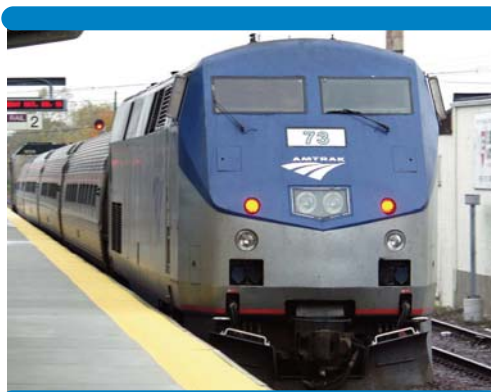
Amtrak Downeaster Train

from across northern New England. Eventually, this service will extend north to White River Junction, VT and to Montreal fulfilling the vision of this designated High-Speed Rail Corridor.