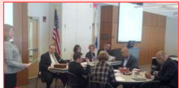
Presentation at Holyoke Community College

Attendees, including board members, college and university presidents and executive staff, gathered to hear presentations on fraud, conflict of interest, fiduciary duties and the fundamentals of trusteeship. A multi-agency panel addressed several hypothetical scenarios relevant to public higher education board members, including trustees' decision-making in the context of their fiduciary duties to the institutions they serve, as well as ethics and conflict-of-interest issues. Many attendees took advantage of the opportunity to raise questions important to their roles and institutions. The Office looks forward to offering additional trainings in the future.