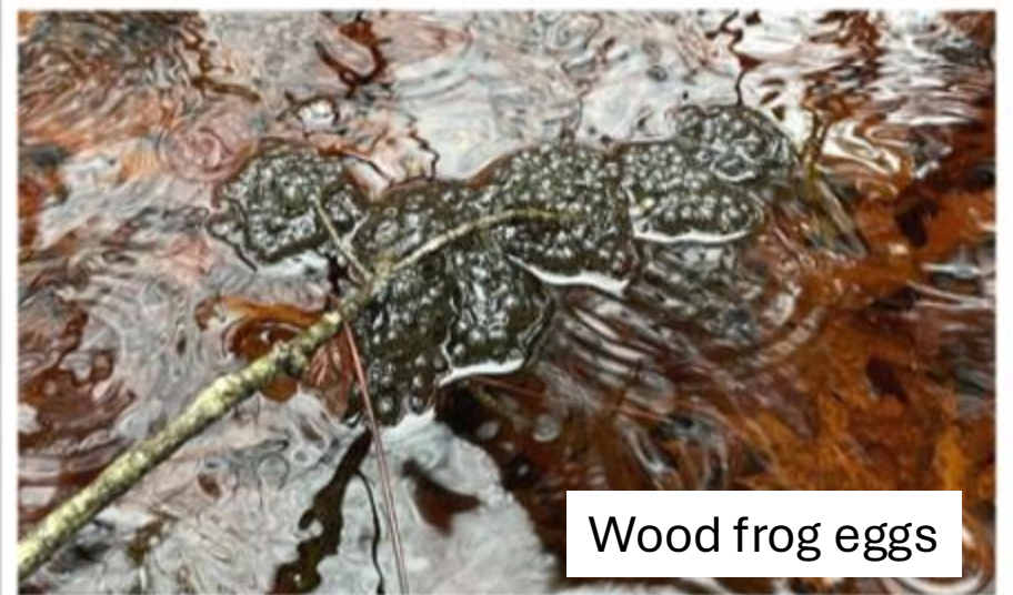
Wood frog eggs