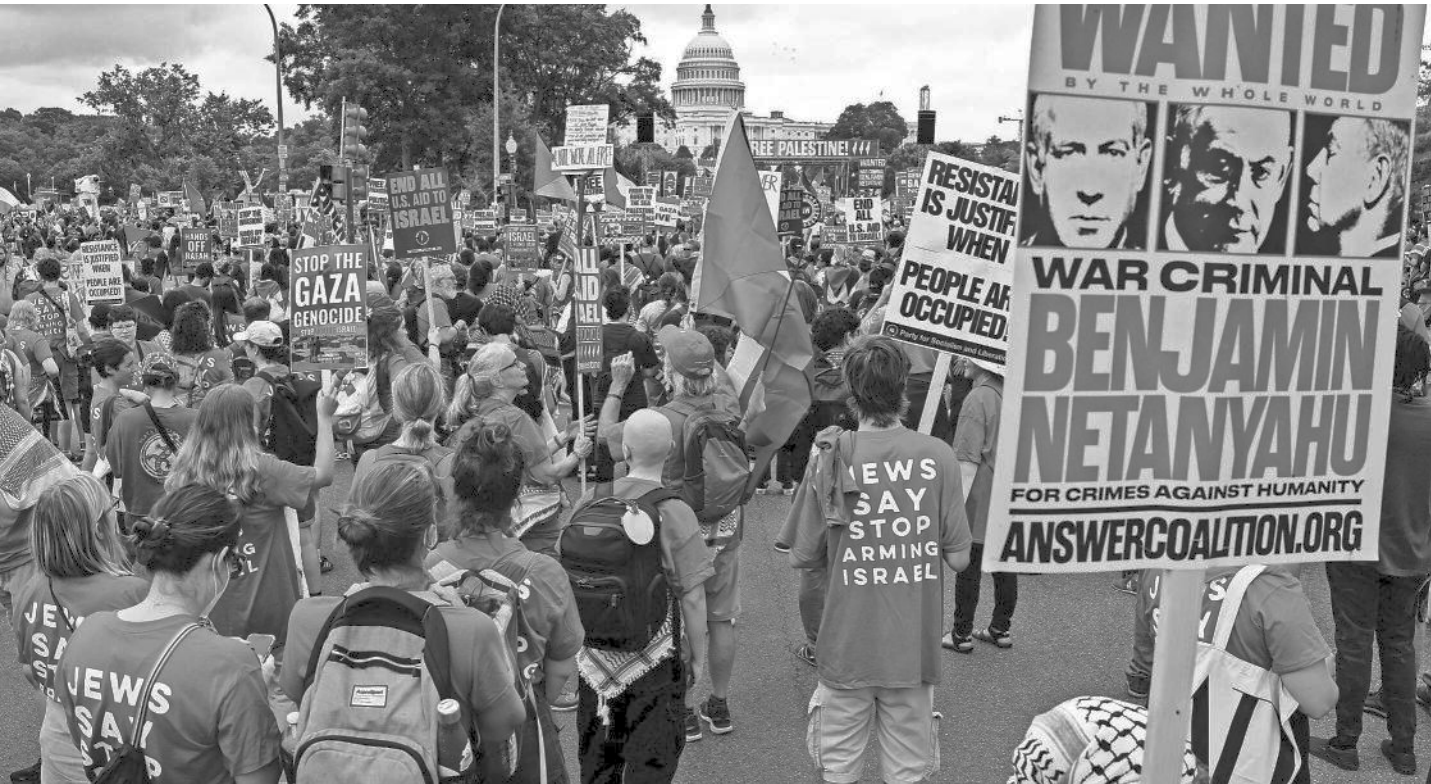
Pro-Palestinian demonstrators gather Wednesday as Israeli Prime Minister Benjamin Netanyahu was set to address Congress.

The Israeli leader’s U.S. visit comes two months after the International Criminal Court announced arrest warrants for Netanyahu, Hamas leader Yahya Sinwar and others on charges of war crimes and crimes against humanity for both the Israeli-led war in Gaza and the Oct. 7 Hamas attack in Israel that sparked it. Netanyahu’s bombing cam-