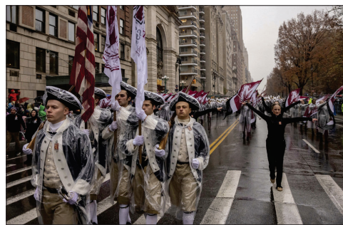
Members of University of Massachusetts Minutemen marching band march along Central Park West.

This year's parade featured 17 giant, helium-filled character balloons, 22 floats, 15 novelty and heritage inflatables, 11 marching bands, including the Minutemen, from as far away as Texas and South Dakota, 700 clowns, 10 performance groups, award-winning singers and actors, and the WNBA champion New York Liberty.