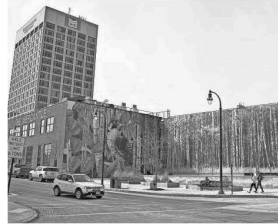
The lot adjacent to the parking garage and behind The Mercantile restaurant may be developed into a hotel.