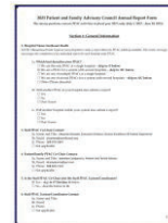
PFAC Annual Reports