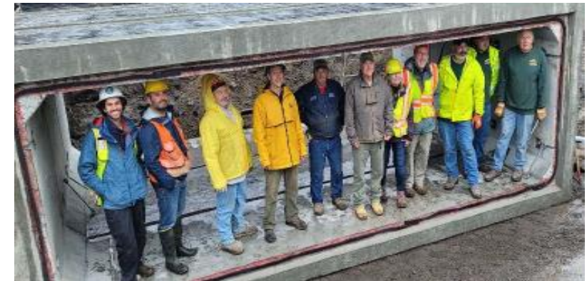
Culvert upgrade as part of the 2022 Pepperell project.