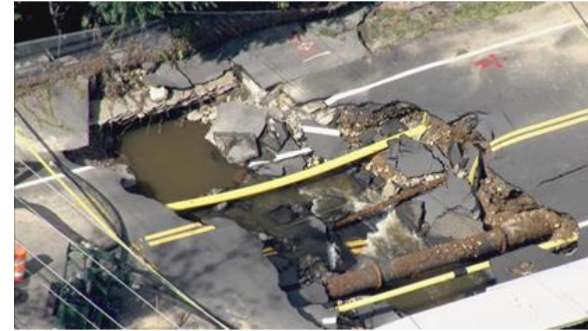
Washed out road in Leominster September 2023