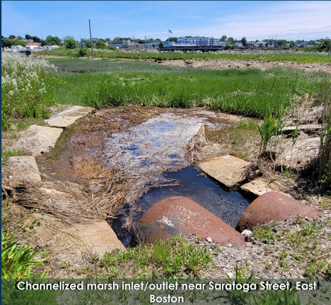
Channelized marsh inlet/outlet near Saratoga Street, East Boston