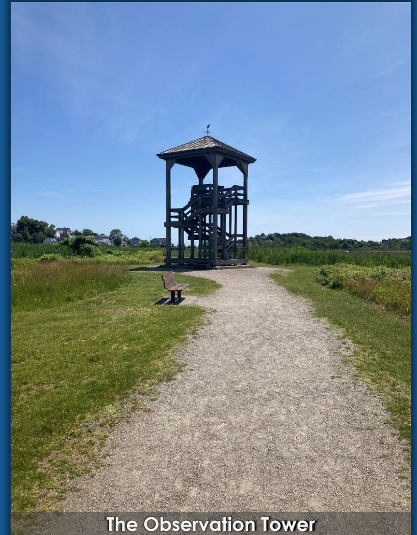
The Observation Tower