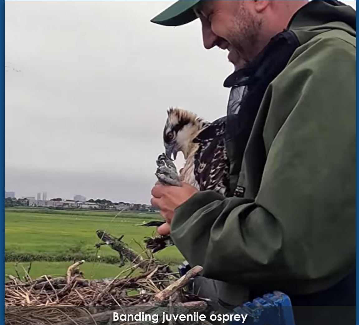
Banding juvenile osprey