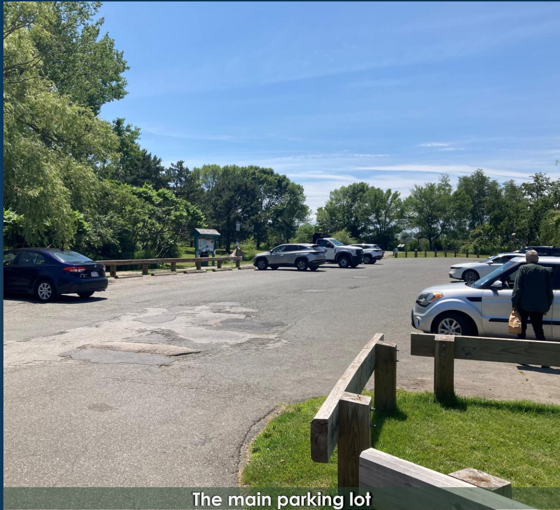
The main parking lot