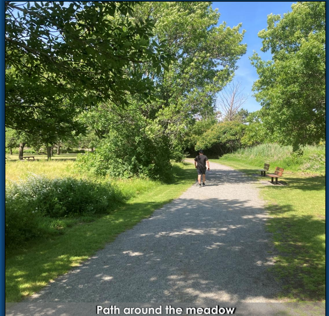
Path around the meadow