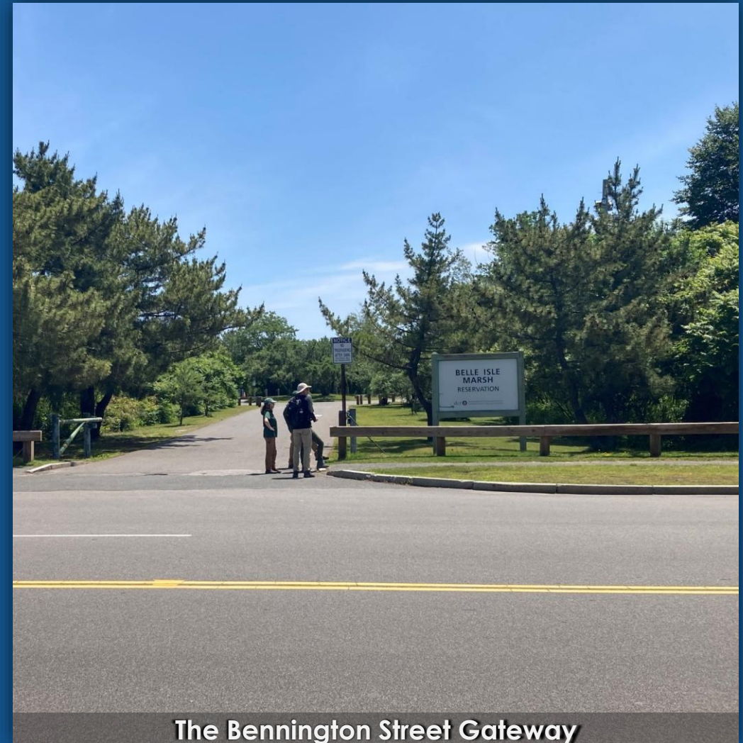
The Bennington Street Gateway