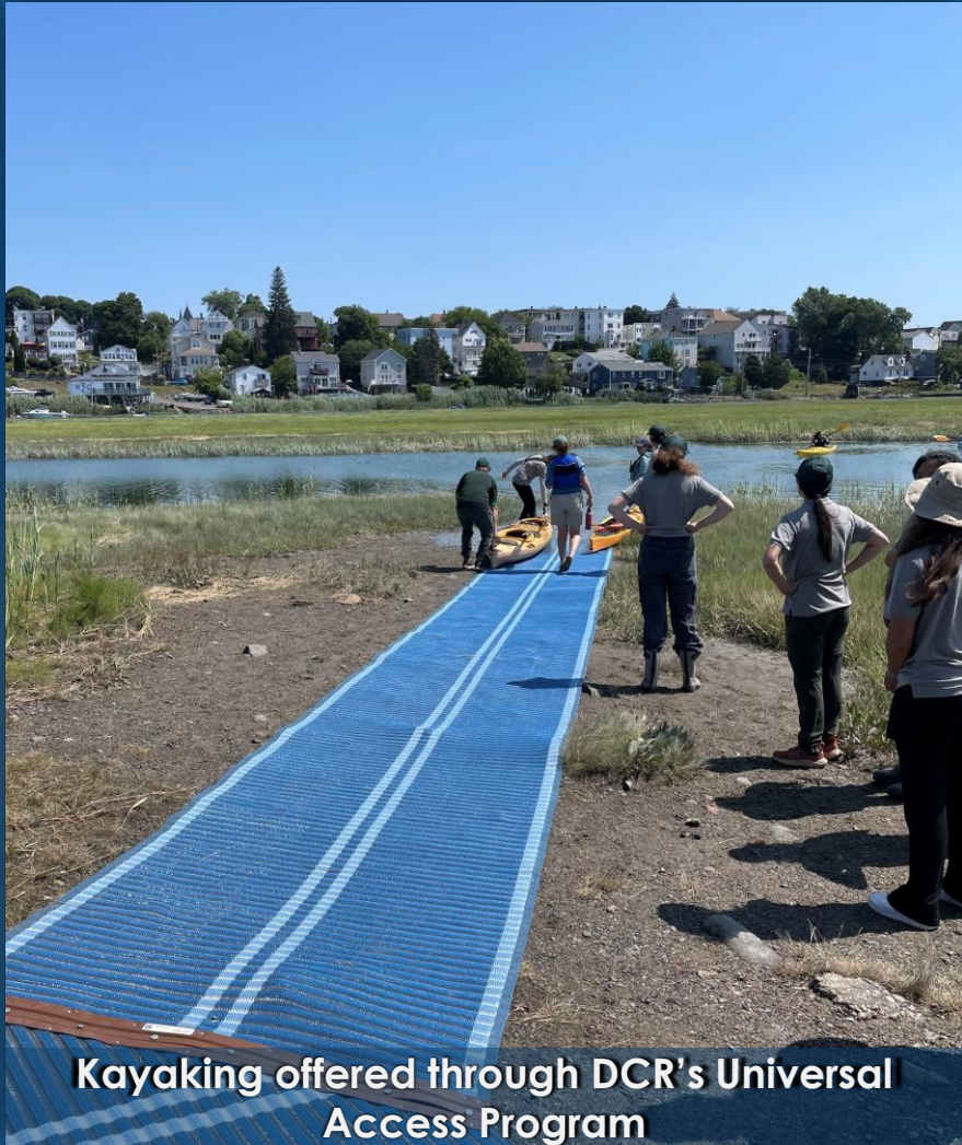
Kayaking offered through DCR's Universal Access Program