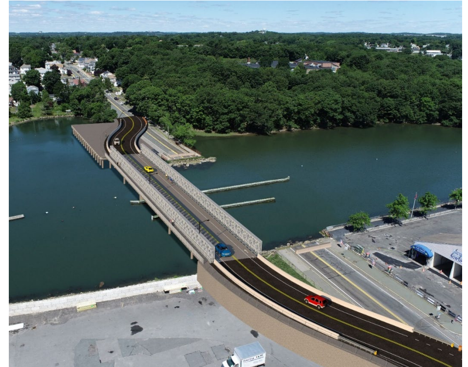
Rendering – Proposed Temporary Bridge, Looking Northeast