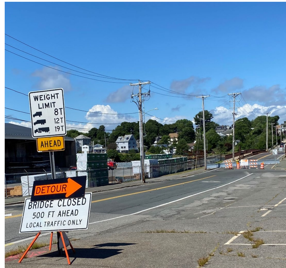
Existing Bridge Closed to Traffic