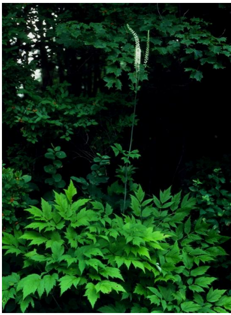
Black Cohosh photos: Top, inflorescence with leaves, J. Coddington. Bottom, plant with tall flowering stalk in habitat: B.A. Sorrie, NHESP.

A Species of Greatest Conservation Need in the Massachusetts State Wildlife Action Plan