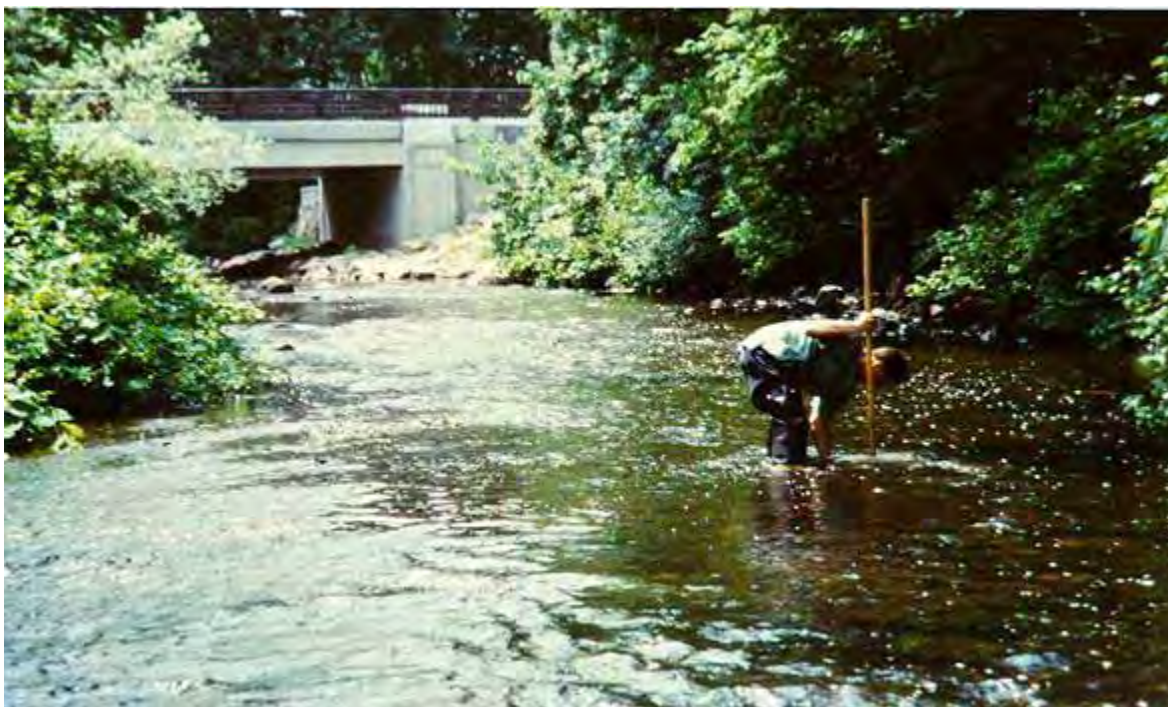
Figure 2. MassDEP/DWM biologist collecting macroinvertebrates using the “kick” sampling technique.

The macroinvertebrate sampling procedures employed during the 2003 Blackstone River watershed biomonitoring survey are described in the standard operating procedures Water Quality Monitoring In Streams Using Aquatic Macroinvertebrates (Nuzzo 2002), and are based on US EPA Rapid Bioassessment Protocols (RBPs) for wadeable streams and rivers (Barbour et al. 1999). The macroinvertebrate collection procedure utilized kick-sampling, a method of sampling benthic organisms by kicking or disturbing bottom sediments and catching the dislodged organisms in a net as the current carries them downstream (Figure 2). Sampling activities were conducted in accordance with the Quality Assurance Project Plan (QAPP) for benthic macroinvertebrate biomonitoring (MassDEP 2003). Sampling was conducted at each station by MassDEP/DWM biologists throughout a 100 m reach, in riffle/run areas with fast currents and rocky (cobble, pebble, and gravel) substrates—generally the most productive habitats, supporting the most diverse communities in the stream system. Ten kicks in squares approximately 0.46 m x 0.46 m were composited for a total sample area of about 2 m 2 . Samples were labeled and preserved in the field with denatured 95% ethanol, then brought to the MassDEP/DWM lab for further processing.