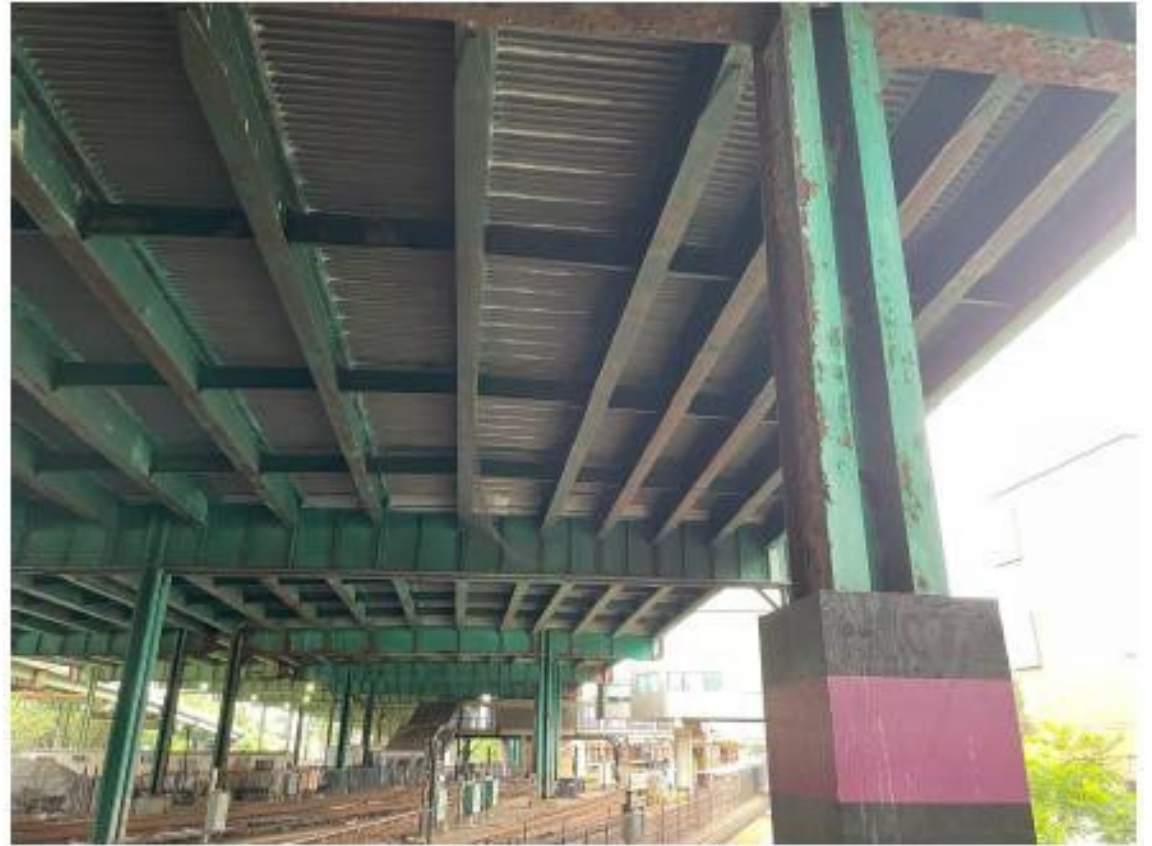
Existing conditions: bridge deck deficiencies