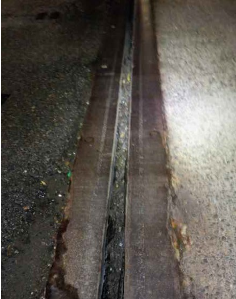
Rusted joint armor and depressed joint seal

Bridge Inspection Photos – December 2021 & 2023