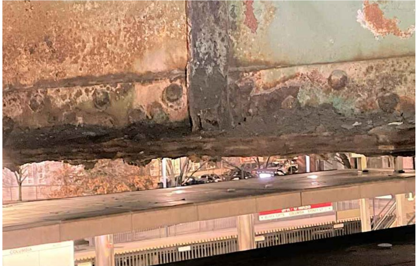
Bent RB3 cap, north face between girders 3&4