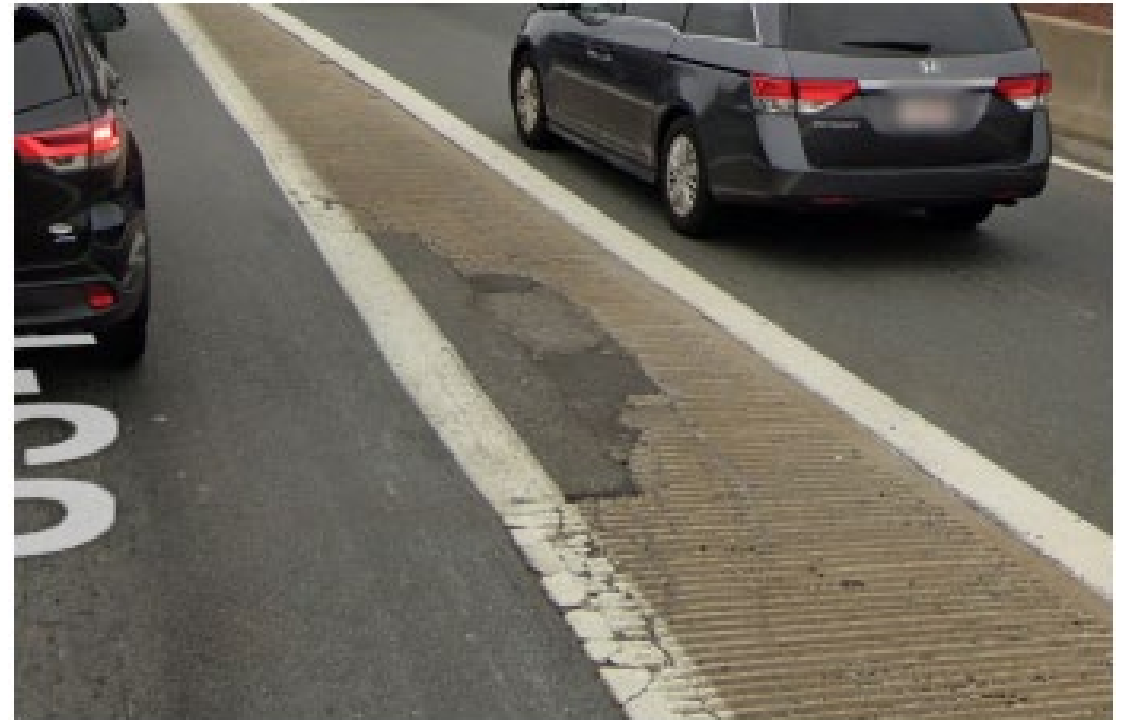
Existing conditions: typical wearing surface deficiencies