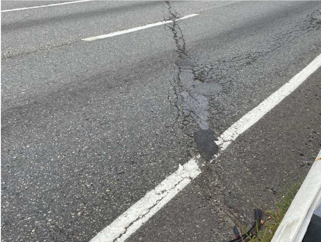
Typical transverse cracking over south abutment

Bridge Inspection Photos – December 2021 & 2023