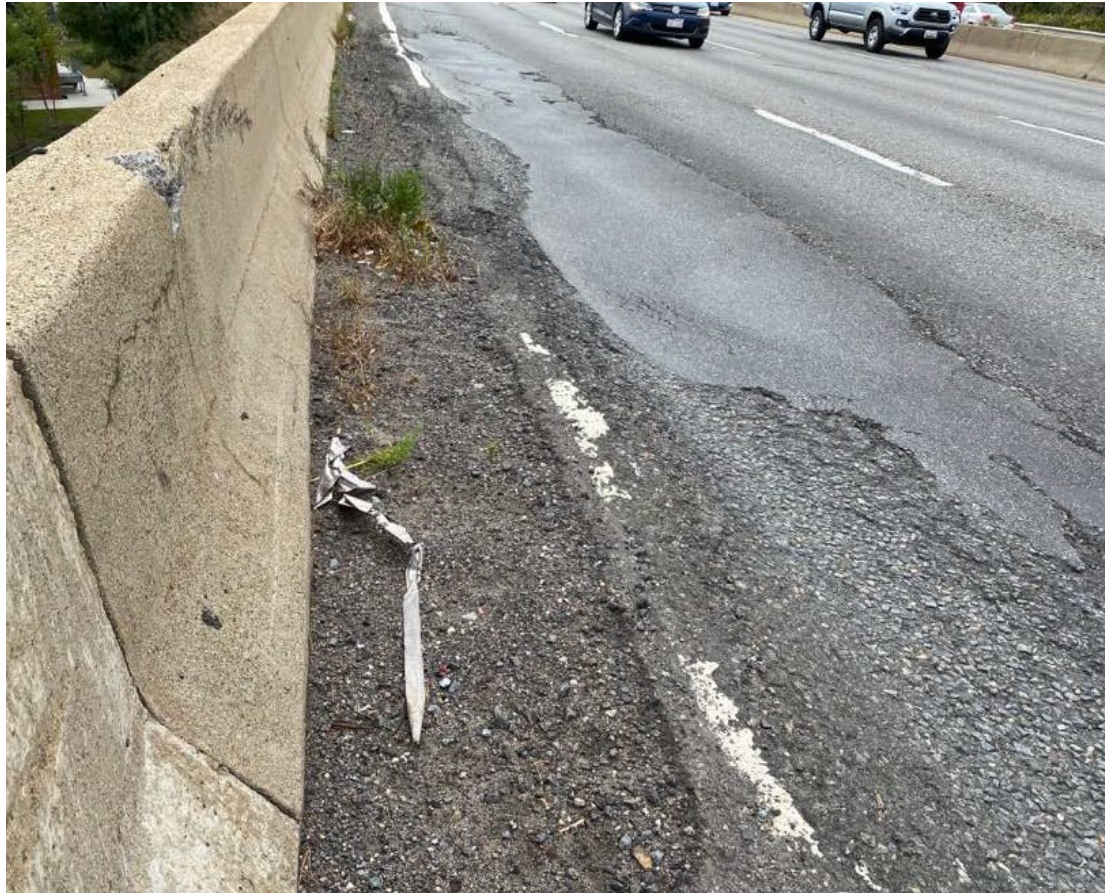
Existing conditions: Moderate cracking in southbound lane with heaving