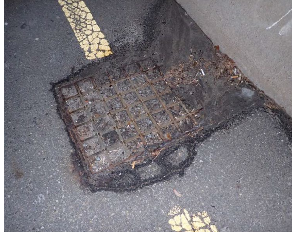
Clogged catch basin (dirt & debris)-east parapet