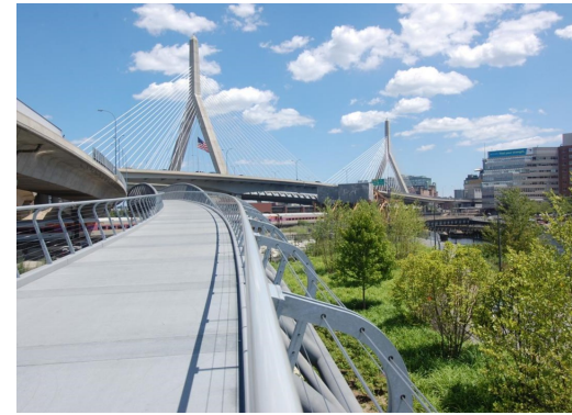
North Bank Bridge connecting Charlestown and Cambridge.