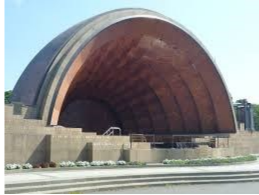
Music shell where the nation celebrates Independence Day .