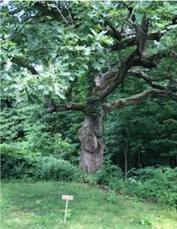
Descendant of the original Waverly Oaks, located at the first reservation within the Metropolitan Park System.