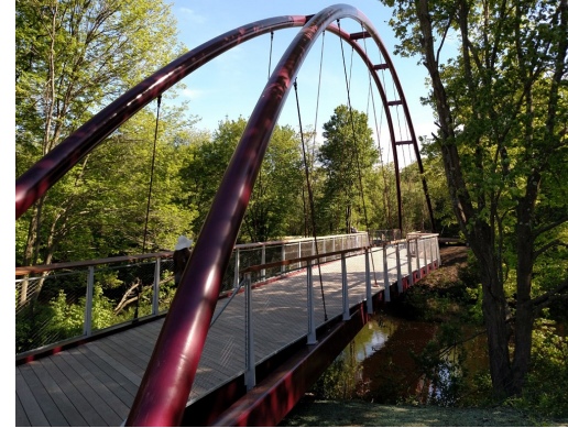
Harvest River Bridge connecting Mattapan and Milton.