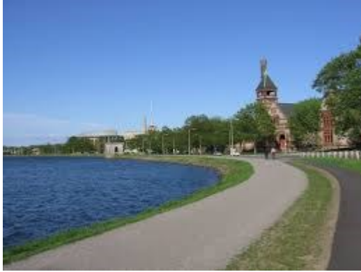
Reservoir created in 1870 to supplement the City of Boston's water needs.