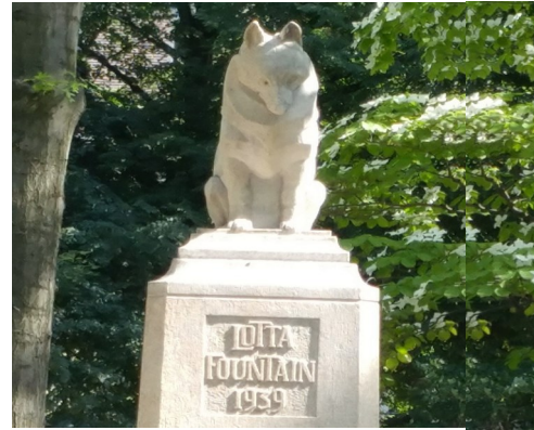
Dog Fountain named for the actress Lotta Crabtree.