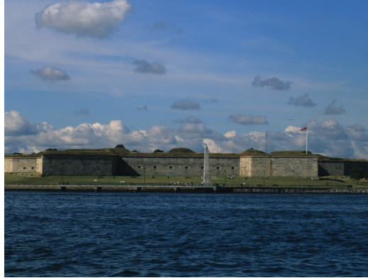
Fort Independence, located on an island, provided harbor defenses for Boston.