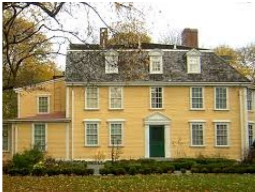
Historic Home and grounds of Quincy and Hancock families.