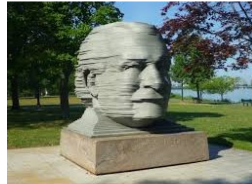
Arthur Fiedler, Conductor of the Boston Pops, started the July 4th tradition at the Hatch.