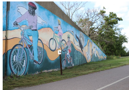
Mural depicting the recreational activities that abound at this park off the expressway.