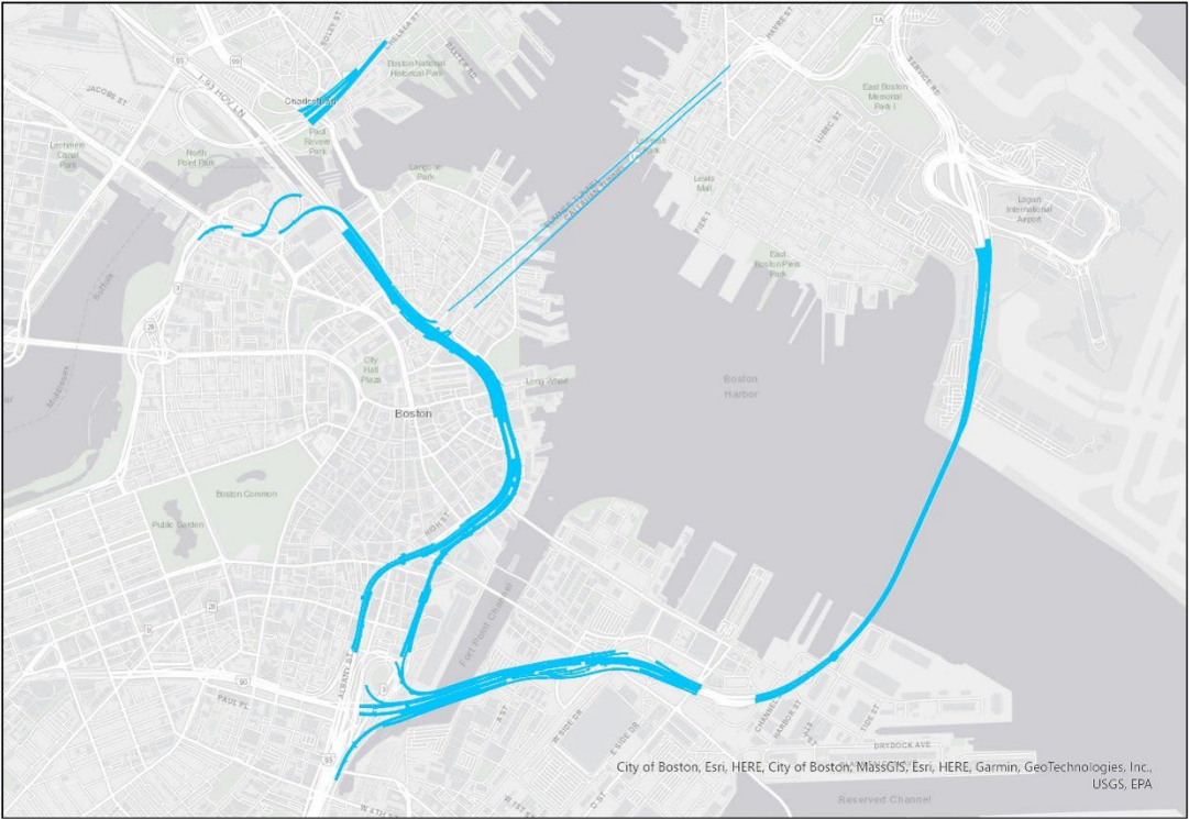
Metropolitan Highway System (MHS) Tunnel Network