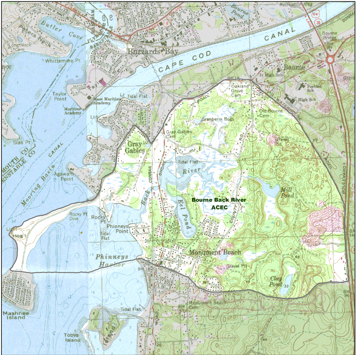
Map # 1a Bourne Back River ACEC Map Tile 1 of 1 ACEC Designated 4/24/89 1,850 Acres