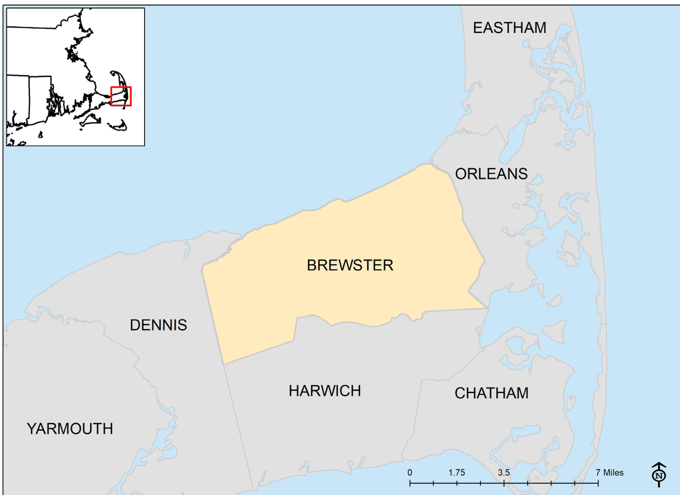
Brewster Municipal Boundary

Map created by the Urban Harbors Institute, UMass Boston With data from MassGIS, March, 2021