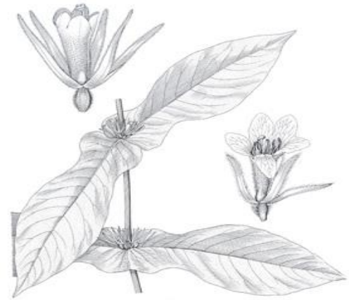
Holmgren, Noel H. 1998. The Illustrated Companion to Gleason and Cronquist's Manual . The New York Botanical Garden.

SIMILAR SPECIES: Wild Coffee, Triosteum aurantiacum (also called Tinker's-weed or Horse-gentian), is very similar to Broad Tinker's-weed, and the two have been considered varieties of the same species by some authors. However, Wild Coffee is readily separable by its much narrower leaves which are not broadly joined around the stem – only a narrow