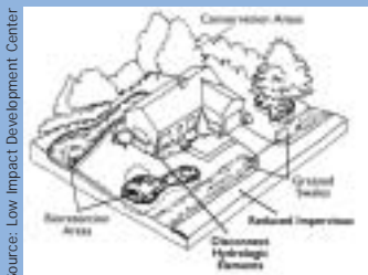
LID Lot Level Source Controls

Water moving through these systems is slowed, filtered, and percolated into the ground. These systems can act as low cost alternatives to curbs, gutters, and pipes.