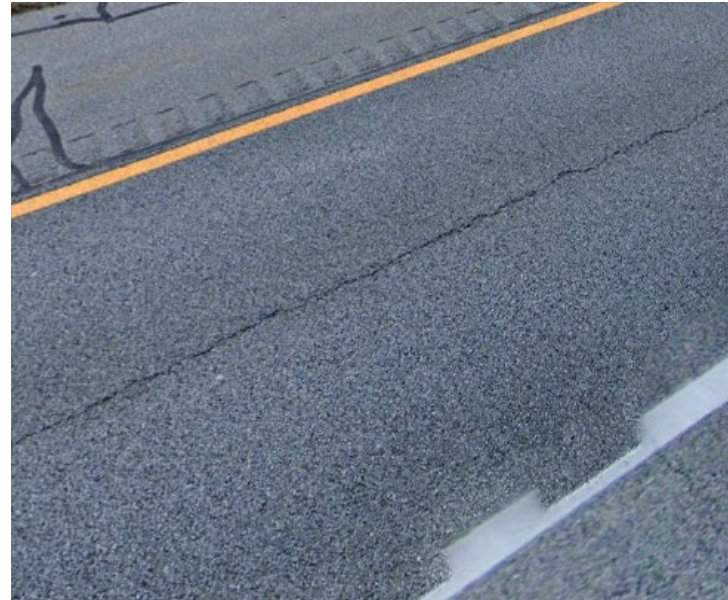
Existing pavement conditions necessitate preservation action (longitudinal pavement cracking shown)