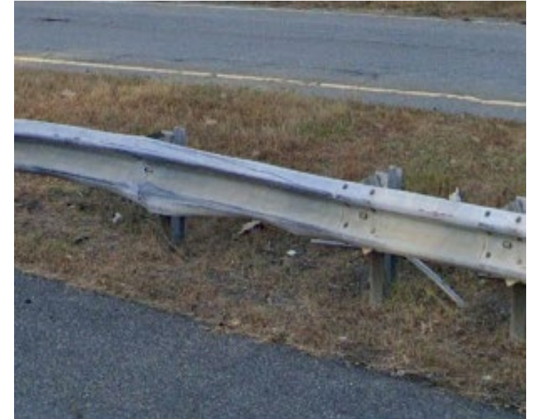
Existing guardrail systems need repair/replacement