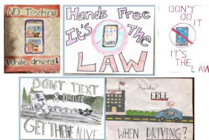
2020 Winning Designs