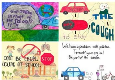
2019 Winning Designs