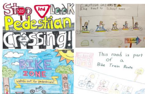
2022 Winning Designs