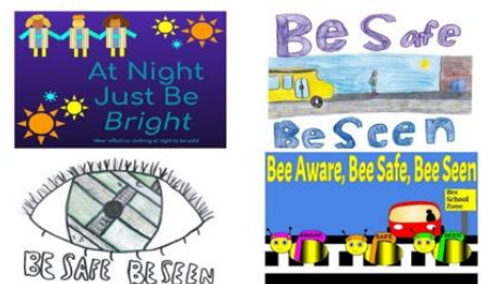
2021 Winning Designs