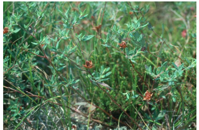
Bushy Rockrose, showing the sprawling habitat.

Morphologically, the more common species is overall more upright with fewer branches, and has less dense leaf pubescence on the upper surface than the rare species. See the key differentiating characters in the table below. Low Frostweed ( C. propinquum ) and Bicknell's Frostweed ( C. bicknellii ) differ from both of the above species in that they produce a greater number of open flowers in corymbs (not singly), lack glandular hairs on the sepals and petioles, and lack simple hairs on the upper leaf surfaces.