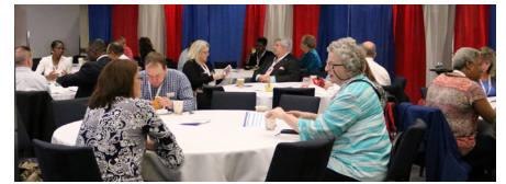
Invited guests enjoyed continental breakfast prior to the start of the awards ceremony.

The 2017 Supplier Diversity Awards Ceremony was held in conjunction with the MASSBUYS EXPO on May 10 at Gillette Stadium in Foxborough. The purpose of this annual event is to recognize and honor the efforts of Commonwealth Departments in support of diverse and small businesses.