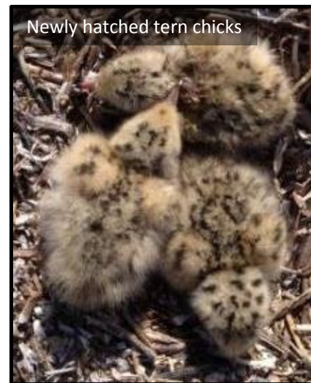
Newly hatched tern chicks

COMPENSATION – Interns may stay at our crew house for no charge. You may be eligible for credit or a monetary stipend through your college; however, MassWildlife does not provide financial compensation.