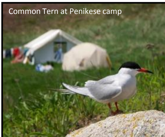
Common Tern at Penikese camp

DATES – Dates are flexible to accommodate college calendars. Our greatest need is from early May through mid-July. Some work on weekends and holidays is expected. Part time or short term opportunities are possible.