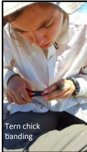
Tern chick banding

Interns are a critical part of our team: they will work closely with the Project Leader and Site Managers and will gain a variety of hands-on skills. Activities include censusing of Common, Roseate, and Arctic Terns; monitoring tern growth and productivity; trapping and banding; reading bands on adults through spotting scopes; monitoring productivity of American Oystercatchers; discouragement, censusing, and monitoring productivity of nesting gulls; habitat management; maintaining field notebooks; and data management.