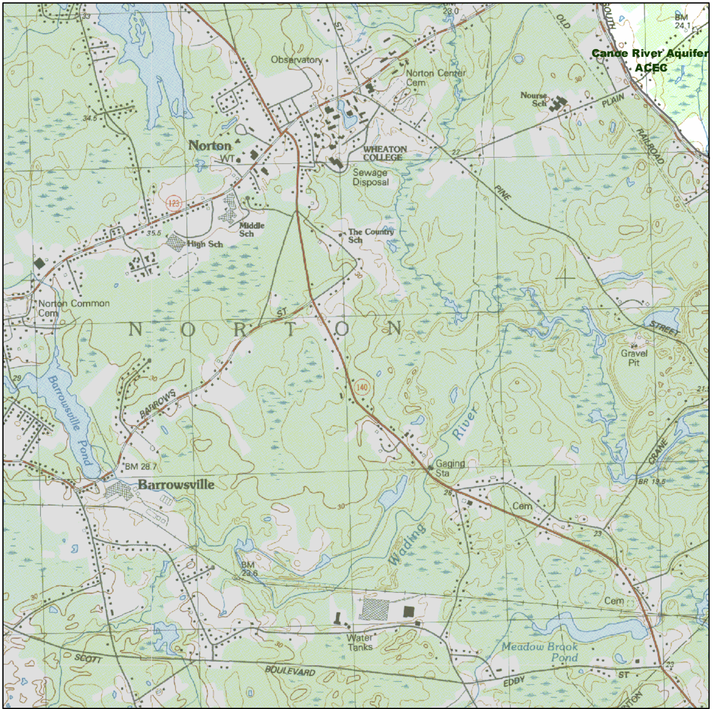
Map # 2h Canoe River Aquifer ACEC Map Tile 8 of 10 ACEC Designated 5/18/91 17,190 Acres