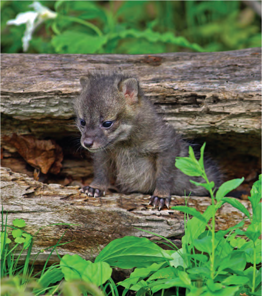
A young gray fox looks out from its den in a downed log.

Messy is good. Park-like forest conditions may be aesthetically pleasing to some humans, but such places are sterile – a sort of wooded desert – for most animals. The food chain starts in the dead wood on the forest floor and the standing snags in the overstory. Brambles, brush, and downed limbs provide food and cover for wildlife. Left to its own devices, nature creates disorder through wind and ice storms, fire, insect infestation, and the limited life-span of trees. Humans can mimic these natural disturbances with chainsaws and feller-bunchers.