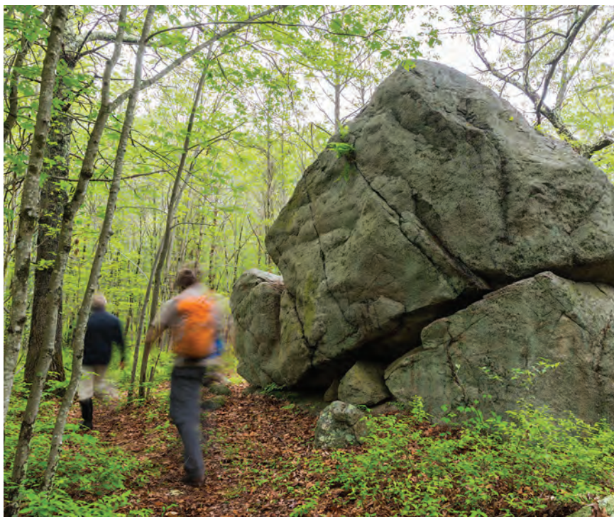
Clockwise from top left: ski-tipped emerald dragonfly, American ginseng, glacial erratic