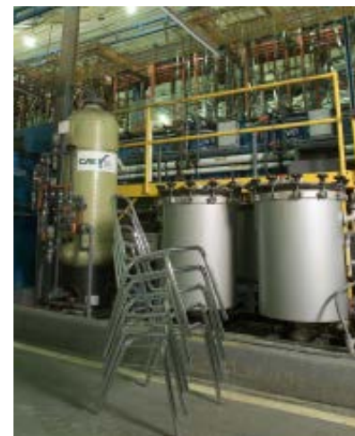
Plating Chair Frame

vacuum distillation units runs through an ion exchange system with the following steps: ultrafiltration, granular activated carbon, ion exchange, final filtration and ultraviolet sterilization. The resulting de-ionized (DI) water is reused on the plating line, resulting in a closed-loop process, where all industrial wastewater discharges to the sewer are eliminated.