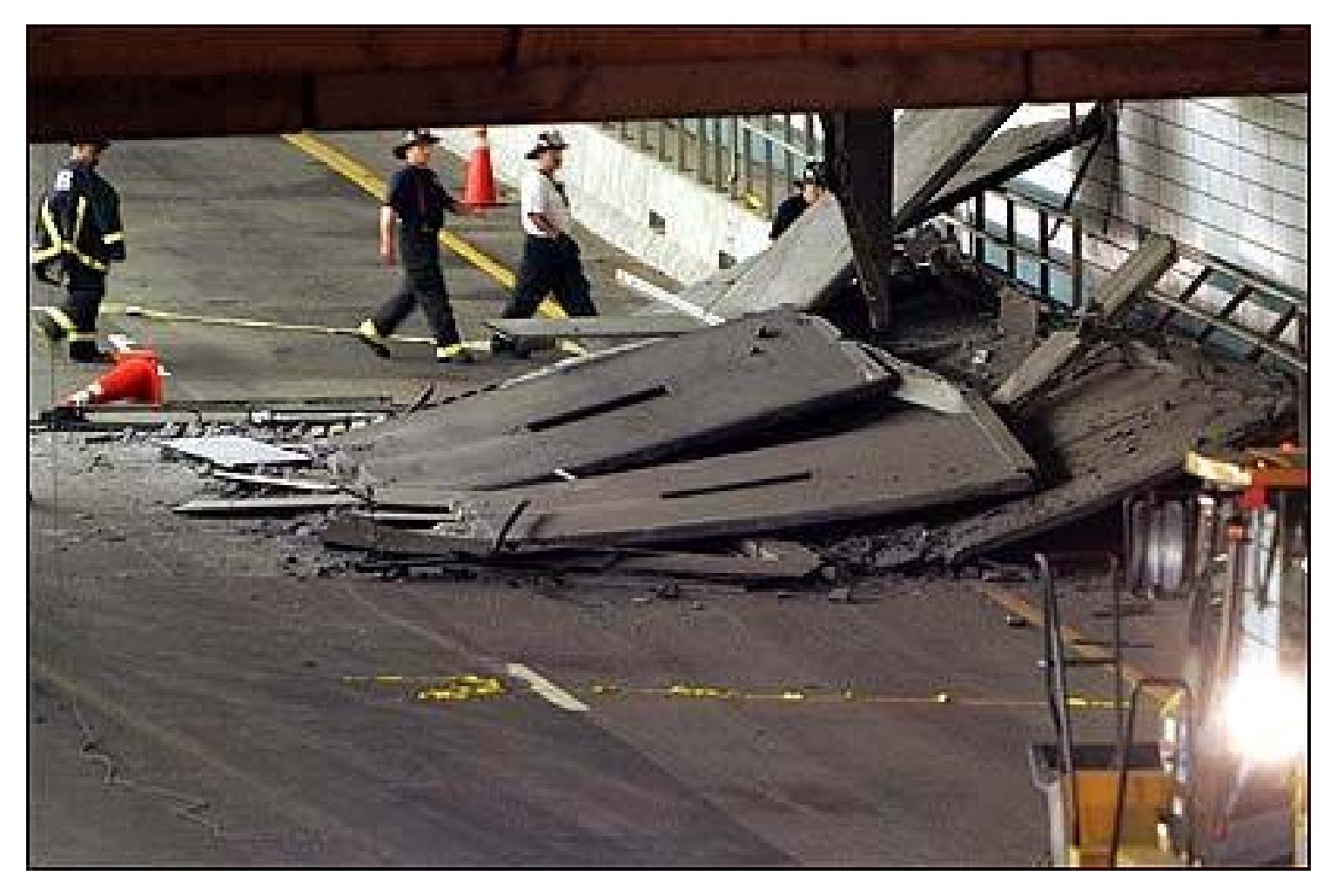
APPENDIX V Interstate 90 Tunnel Ceiling Collapse