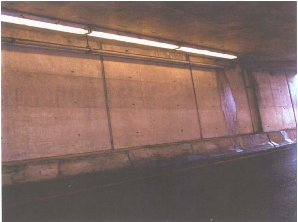
DCP_0014 Wall leakage