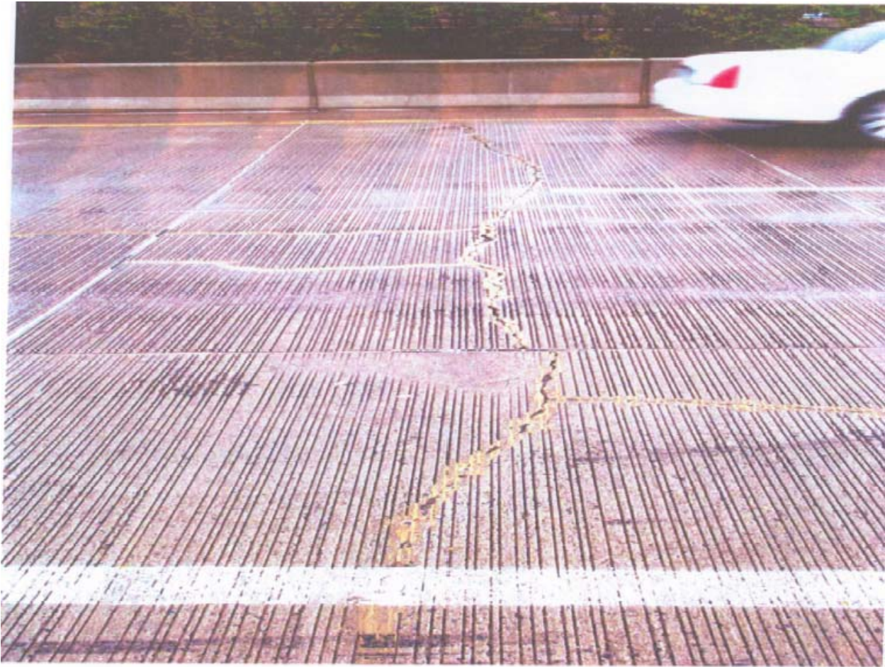
DCP_0033 Logan ramp TA/D overlay cracks