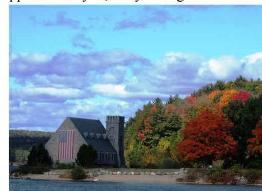
This impressive church remains as the last remnant of the town in the valley, which was flooded to make the reservoir.