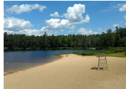
In the 1930s, visitors enjoyed a dance pavilion or a steamboat ride. Today, enjoy a campground and beach.