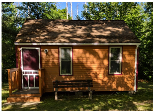
At this Nature Center, find out about the park's popular Carpenter's Rock