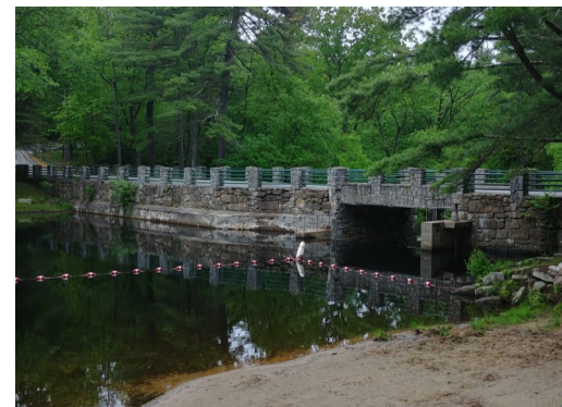
Historic 1930s bridge and dam built by the CCC to repair flood damage to Damon Pond