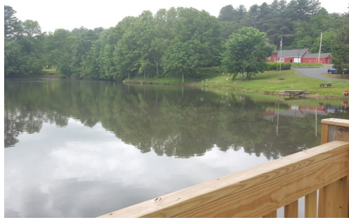
Overlook an historic canal and barn. References of the area's farm to factory story.