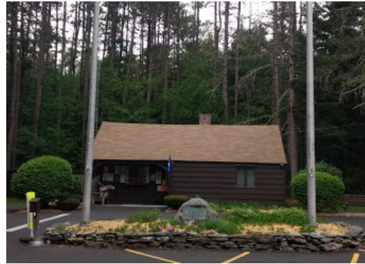
At the first state forest acquired in Massachusetts, this contact station was built by the CCC.