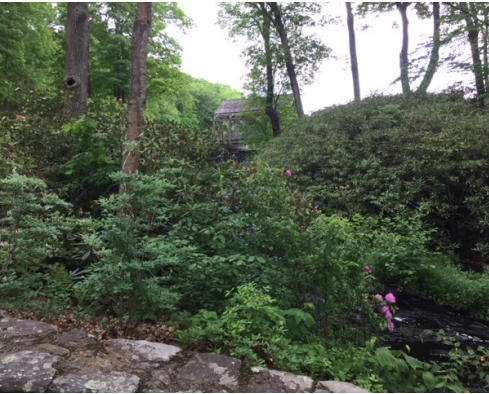
Enchanta Bridge overlooks formerly a mill village and then a wealthy estate