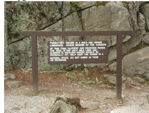
Unique natural landmark formed by the sudden release of glacial meltwater approximately 14,000 years ago