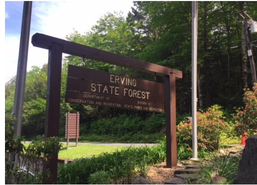
The wonderful trail and the beautiful lake share the same name at this park.