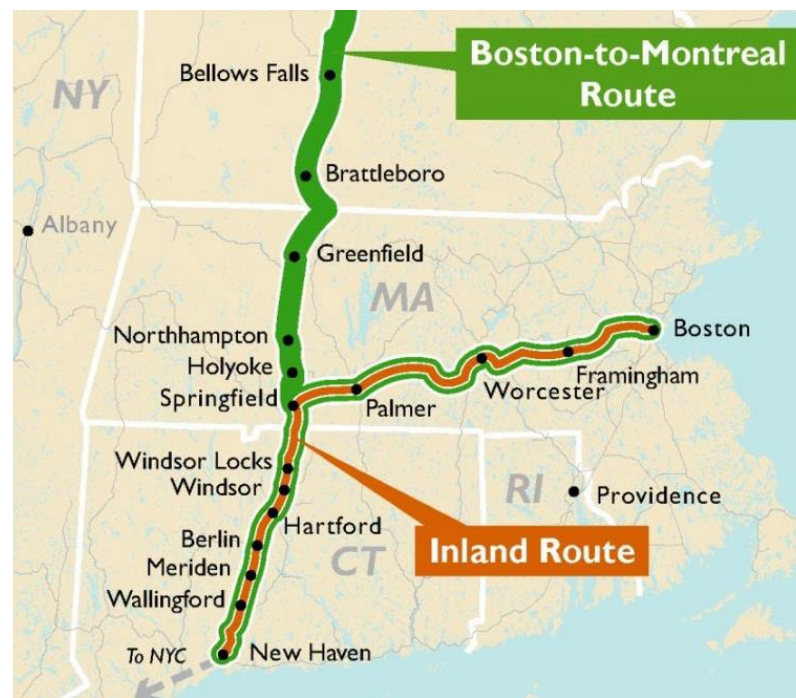
Figure 2-2 – Northern New England Intercity Rail Initiative (NNEIRI)

In 2016, the NNEIRI study completed a Tier 1 Environmental Assessment (EA) through the National Environmental Policy Act (NEPA). The NNEIRI Tier 1 EA assessed corridor-level benefits and impacts. It included an Alternatives Analysis and a Service Development Plan, which provided evaluation of three alternatives with a range of improvements, costs, speeds, and frequencies. Alternatives with speeds greater than 90 mph were not advanced due to right-of-way constraints. As a result, the best travel time for NNEIRI alternatives was 1:49 between Boston and Springfield. Based on the EA, the Federal Railroad issued a Finding of No Significant Impact (FONSI), which determined that the project would have no significant environmental impacts and could move forward without an Environmental Impact Statement. The next phase of review would be a Tier 2 NEPA review, which would investigate more detailed project-level benefits and impacts.