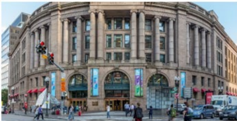
South Station Expansion (SSX)