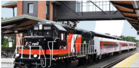
NHHS Rail Program (CTrail Hartford Line)