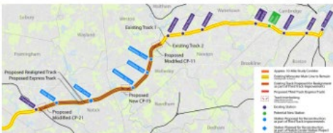
Worcester Triple Tracking Study