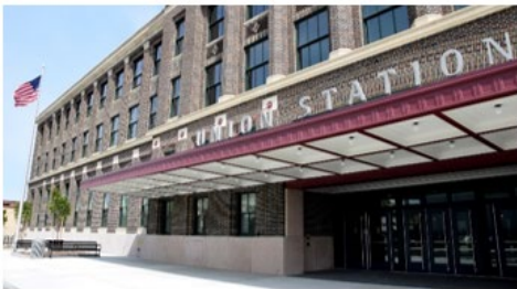
Springfield Union Station Improvements