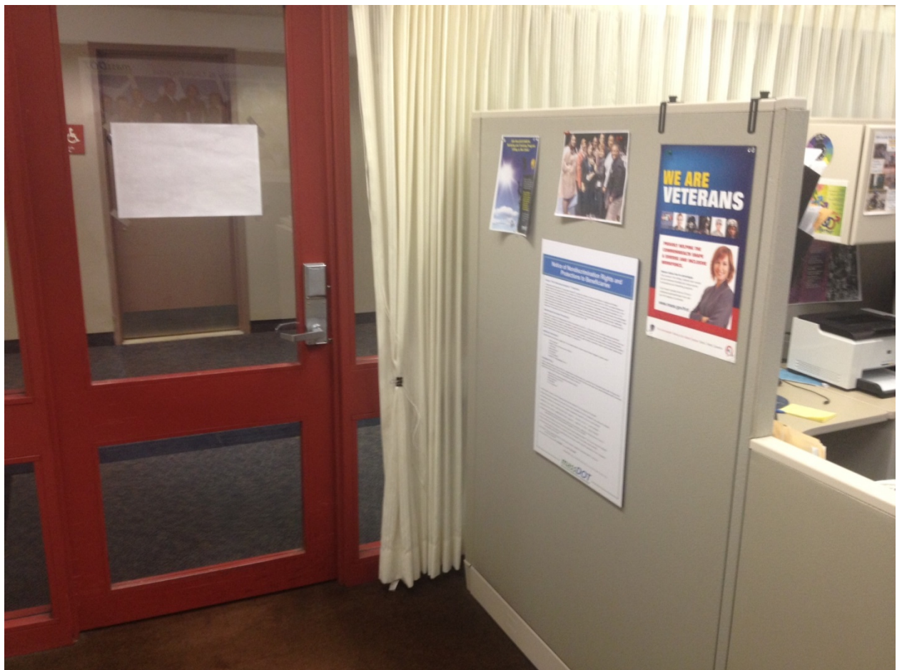
Figure 02.1 Title VI Notice posted at public entrance to MassDOT Office of Diversity and Civil Rights

Included here are photographs of the Title VI Notice to Beneficiaries poster on display in MassDOT's public offices.