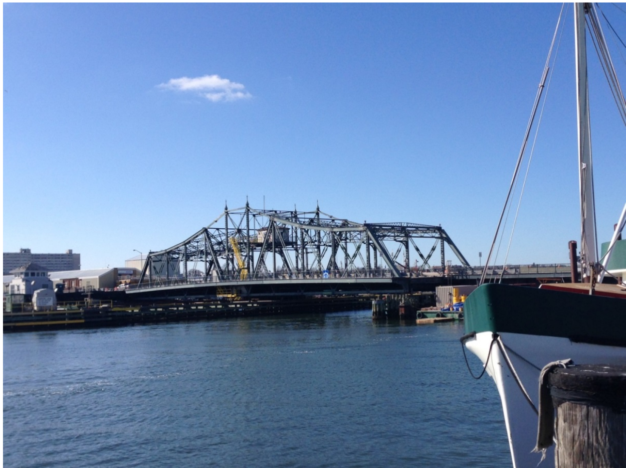
Figure 4.1. Existing Middle Bridge Swing Span Opening for Marine Traffic

The existing bridge structure was constructed between 1896 and 1903 and has undergone a number of repairs and rehabilitations over the last century. The bridge most recently a complete rehabilitation in 1994 and a program of major repairs began in 1999. Although the bridge structure has been rehabilitated and repaired over the years, much of the original superstructure elements remain. As shown in Figure 4.1, the superstructure for this bridge is the swinging portion of the bridge made of steel truss sections and the connected roadway deck.