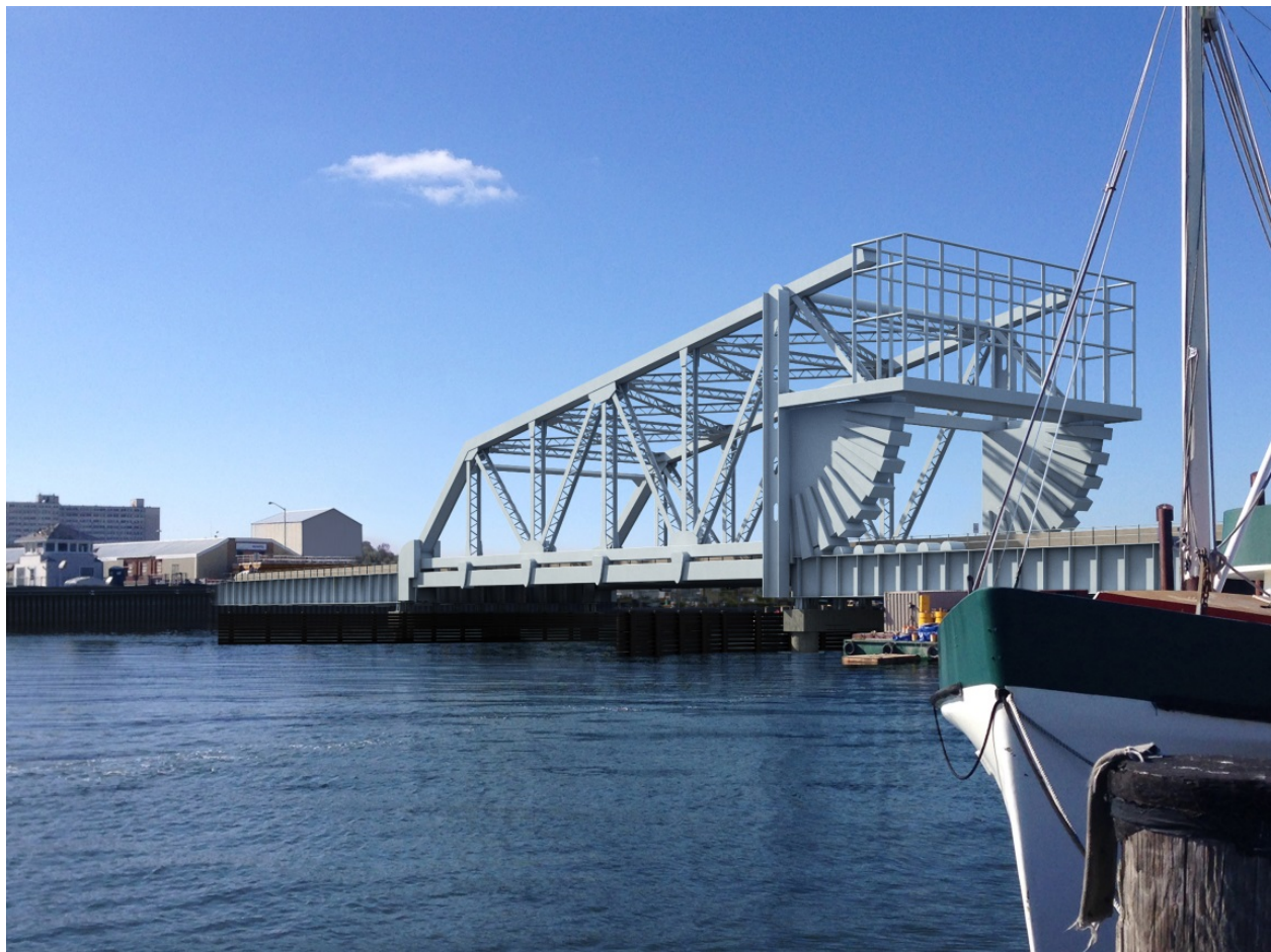
Figure 4.6. Alternative 3: Single-leaf Rolling Bascule Bridge in Closed Position

Alternative 3 is a single-leaf rolling bascule bridge that provides 150 feet of navigational clearance and unlimited air draft. The bridge profile includes a truss structure, similar to the existing bridge structure, located above the roadway. In addition, a counterweight would be located above the truss structure. Figures 4.6 and 4.7 provide simulated renderings for what Alternative 2 would look like if standing at Captain Leroy's marina on Pope's Island. Figure 4.6 shows the bridge in the closed position (open for vehicular traffic). Figure 4.7 shows the bridge in the open position (closed for vehicular traffic).