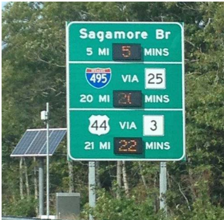
Figure 4.12. Roadside ITS/Changeable Signage

The system could be upgraded to include the implementation of the MassDOT “GO Time” System or a similar functionality. In 2012, MassDOT initiated an operational test of a Bluetooth-based real time traveler information system. The system calculates travel time between two or more points along the roadway by using time stamps collected from anonymous wireless devices, and displays these live travel times on roadside portable variable message signs. Based on positive feedback from the initial test, MassDOT proceeded with the development of a statewide expansion. As part of the system rollout, MassDOT is installing travel time signs consistent with Manual of Uniform Traffic Control Devices . An example of these signs is shown in Figure 4.12. These signs display the travel time to specific points along the highway. MassDOT currently plans to install this system along I-195.