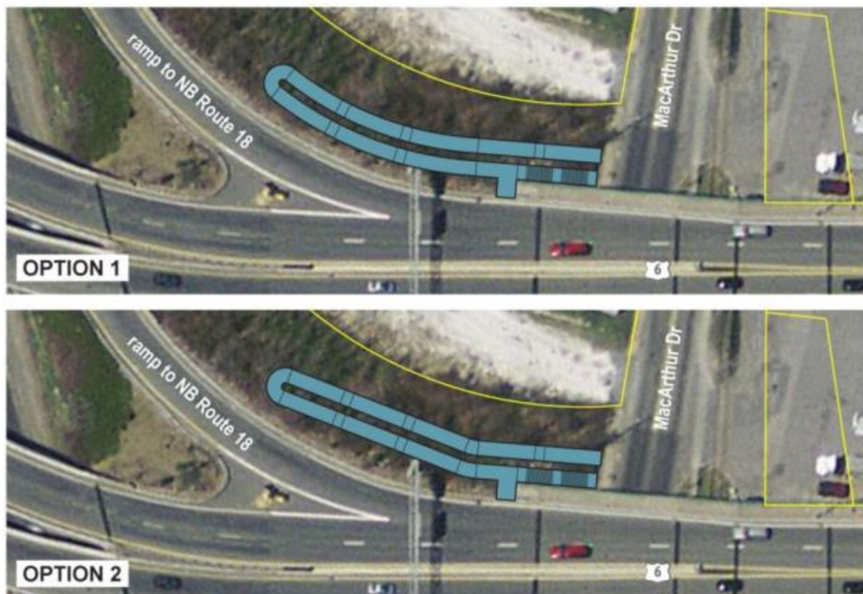
Figure 4.9. Potential Bike/Pedestrian Ramp Options

Two different options for the ADA-compliant bicycle/pedestrian ramp are shown in Figure 4.9.