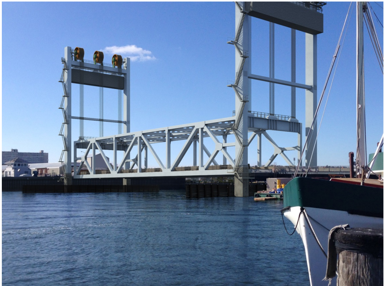
Figure 4.2. Alternative 1: Vertical Lift Bridge in Closed Position

Alternative 1 is a vertical lift bridge that provides 270 feet of navigational clearance and up to 135 feet of air draft. As shown in Figures 4.2 and 4.3, this alternative has two towers that are used to house the mechanical equipment used to raise and lower the bridge structure. Figures 4.2 and 4.3 provide simulated renderings of what Alternative 1 would look like if standing at Captain Leroy's marina on Pope's Island. Figure 4.2 shows the bridge in the closed position (open for vehicular traffic). Figure 4.3 shows the bridge in the open position (closed for vehicular traffic).