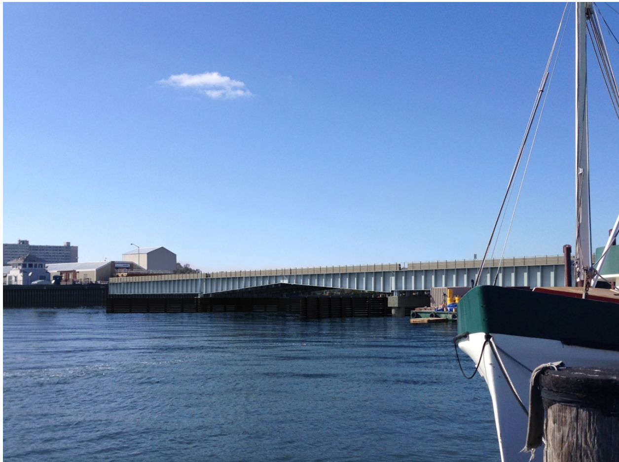
Figure 4.4. Alternative 2: Double-leaf Bascul Bridge in Closed Position

Alternative 2 is a double-leaf bascule bridge (standard) that provides 150 feet of navigational clearance and unlimited air draft. The counterweights and mechanical equipment that is necessary to open the bridge are located in the bascule piers below the bridge deck. Figures 4.4 and 4.5 provide simulated renderings for what Alternative 2 would look like if standing at Captain Leroy's marina on Pope's Island. Figure 4.4 shows the bridge in the closed position (open for vehicular traffic). Figure 4.5 shows the bridge in the open position (closed for vehicular traffic).