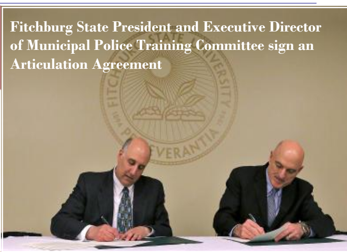
Fitchburg State President and Executive Director of Municipal Police Training Committee sign an Articulation Agreement

Visit the Official Blog of the MPTC to learn more about recent MPTC events, milestones, and news.