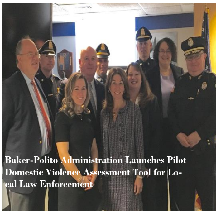
Baker-Polito Administration Launches Pilot Domestic Violence Assessment Tool for Local Law Enforcement