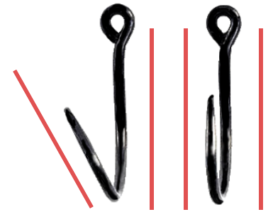
offset hook circle hook

Circle hooks are designed so that the point is turned back towards the shank at a 90° angle. This causes the hook to catch on the lip or mouth instead of the gut or gills.