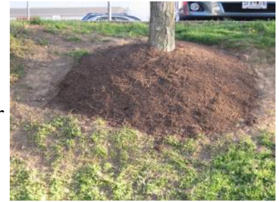
Photo 8. Too much mulch

drainage rates. Arborists should be prepared to encounter and treat both ordinary, and sometimes mundane, issues, like over-mulching around the base of a tree, (Photo 8) and not-so-ordinary scenarios; many of us were surprised, after all, to see widespread salt injury after Hurricane Sandy showered conifers with salt spray a few seasons ago (Photo 9)!