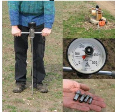
Photo 7. Soil penetrometer

helps give us an understanding into nutrient/essential element availability to plants on a given site. (ii) Bulk density (Db) is a measurement of the weight of soil in a given volume ( \text{g}/\text{cm}^3 ), hence a higher number indicates a potentially more compacted soil. For example, 2.65 \text{ g}/\text{cm}^3 is the density of rock.