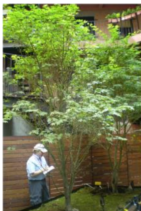
Photo 1. Japanese maples at brownstone apartments in New York City.