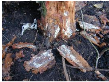
Photo 4. Diagnosing armillaria root rot.

Step Three: Utilize diagnostic resources correctly Properly submitting samples to a lab sounds simple, but the quality of the sample can make the difference