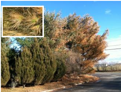
Photo 9. Salt damage. Riverhead, Long Island, NY. M. Daughtrey, Jan. 2013

Readings of 1.4 to 1.6 \text{ g}/\text{cm}^3 can be indicative of soil that may limit root development, foster poor drainage, or inhibit oxygen exchange depending on soil texture. To quickly identify potential soil compaction on-site, practitioners should consider investing in a soil compaction tester, commonly called a penetrometer (Photo 7). (iii) Soil organic matter (SOM) is another important component of soil health. Ideal levels of SOM generally range around 5% (3-6%), per the soil test report. (iv) Overall abnormalities are also important to look for, including nutrient reading levels that may be aberrantly high or low.