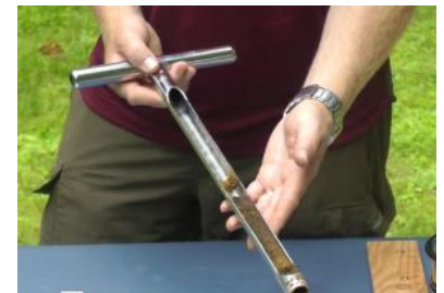
Photo 6. Sampling soil to the proper depth of six to eight inches.

Learning to interpret a soil report is also important, and from a practitioner's perspective, we can start by examining the four following factors: (i) The soil pH