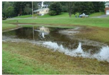
Photo 3. Pooling in the landscape

In addition to some very wet seasons, we have also experienced some very hot growing seasons in recent years. The growing seasons of 2010, 2012, and 2016 were among the hottest we’ve seen in the Northeast. During periods of intense heat – especially when it is coupled with little rainfall – trees and shrubs in the landscape can become very stressed. During some of these seasons, I remember scouting for pests on ornamental trees that had already started shedding their leaves in July! Under these acutely stressful conditions, we need to understand that plants will not necessarily be