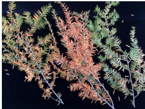
Photo 5. Proper sample submission to the lab showing an array of transitional phases of disease: one not bad (right), one transitional (left), and one showing a lot of desiccation (center). www.ag.umass.edu .

between a frustrated diagnostician and a helpful diagnosis. If a sample that you've been meaning to get to a lab has sat too long in a plastic bag, other pathogens may develop, or, if left on a shelf or in a fridge for an extended period of time, a sample can dry out. One problem I've encountered are samples that sit for a period of time in a post office, perhaps over the weekend, if they are mailed near the end of the workweek. Properly submitted samples should be freshly taken and consist of both healthy tissue and affected tissue that is expedited to a diagnostic lab (Photo 5). To give an idea as to the quantity of plant material, samples should generally be shipped in a gallon-sized, re-sealable plastic bag and be accompanied by photos of the plant, in situ . Samples should always include the proper paperwork with information that answers important questions like 'Where did the sample come from?' 'How long has it been experiencing symptoms?' There have