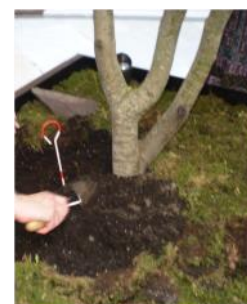
Photo 2. Looking for larger lateral roots with a surveyor chaining pin.