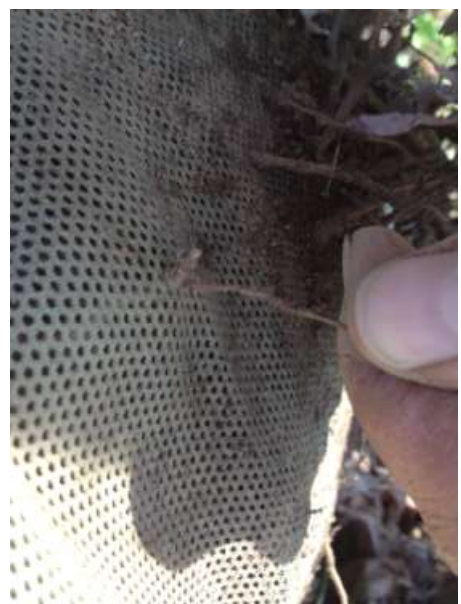
Inspecting roots growing through a fabric container. This tree was produced using the in-ground fabric method. (Rick Harper)

spot-checking a select number of B&B trees (5% - 20%) can allow for a full visual inspection of the root system, where consideration should be given to inspecting for radial/lateral root production, the presence of a taproot (generally not desired), and other root-related imperfections. One key benefit associated with B&B production is that mechanical injury of roots often occurs less because of the volume of soil protecting the lower portion of the tree. A final perspective concerning B&B trees is the diameter of root ball associated with the trunk size. All too often, trees that I have dug up that have performed poorly or simply died have not had the volume of root material needed to support the above-ground portion of the tree. Though technical specifications exist from the American Standard for Nursery Stock concerning root ball diameter as the caliper of the trees increases by every 0.5 ", a general rule of thumb that can be used in the field is that for every inch of stem diameter there needs to be at least 10 " of corresponding root ball diameter.