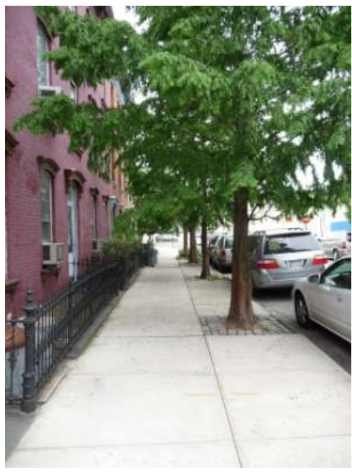
Dawn redwoods as street trees in New York City (Alan Snow)

http://arnoldia.arboretum.harvard.edu/pdf/issues/189.pdf Metasequoia glyptostroboides.IUCN Red List. http://www.iucnredlist.org/details/32317/0.